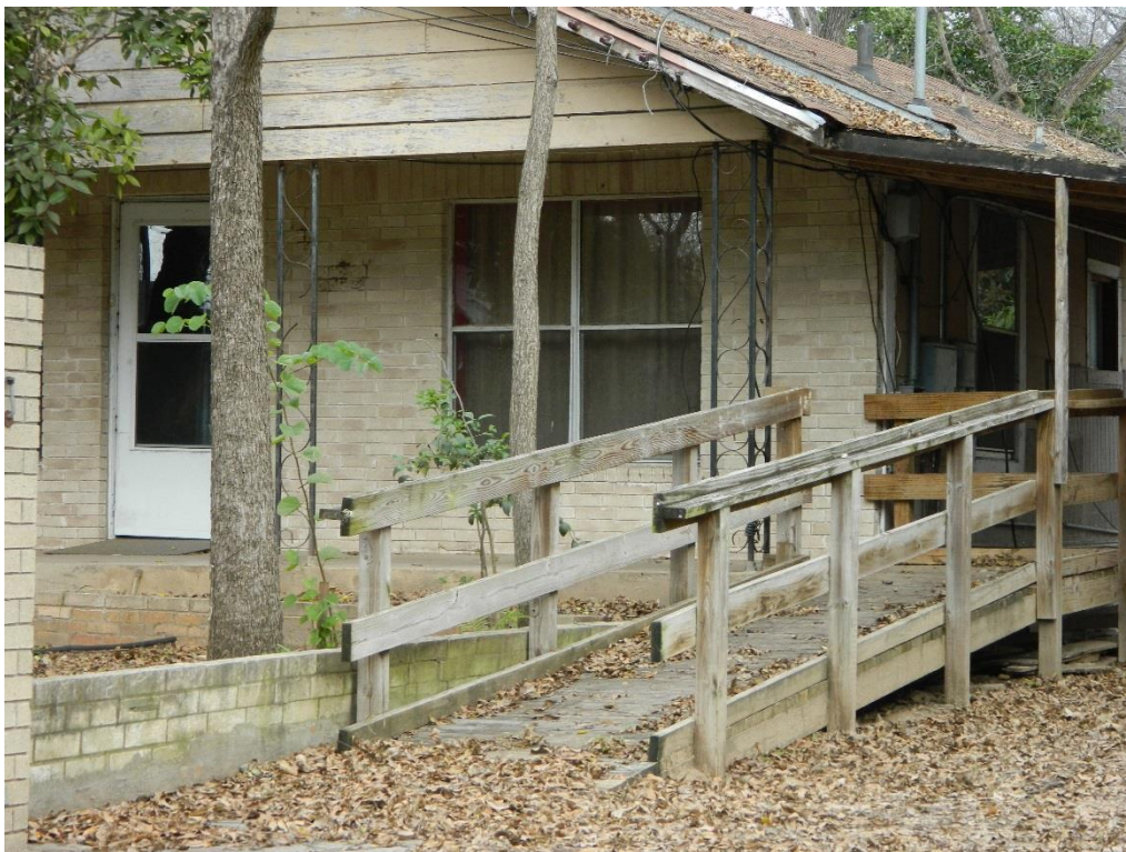
OCCUPANCY HISTORY 1506 Haskell Street