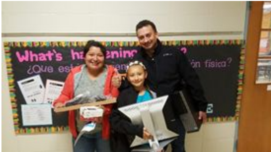
(Family of Sanchez Elementary Student)

"I'm happy with it it has been working great, no problems. I use computer mainly for school work but also for volunteer work at HACA. I'm very careful about not using with family and friends because it is a loaned device. I do use it for gmail for ACC and blackboard."