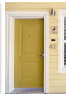
Jeremiah Housing Moody Campus