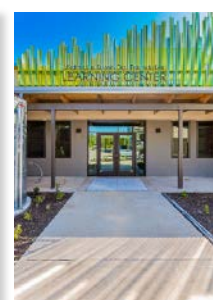
Lakeline Station Apartments Rutledge Spur