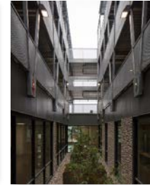
Bluebonnet Studios South Lamar Blvd.