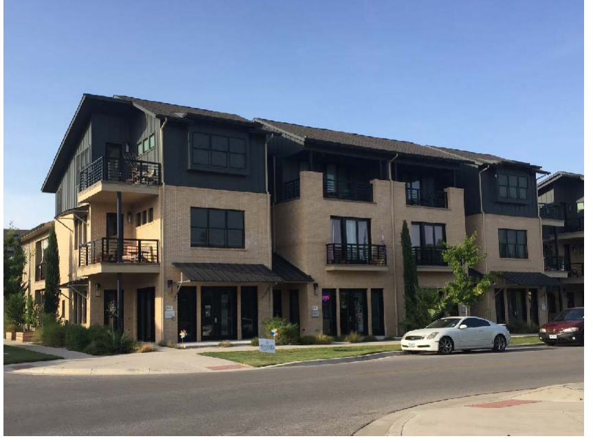
ASIAN AMERICAN QUALITY OF LIFE ADVISORY COMMISSION January 15, 2019