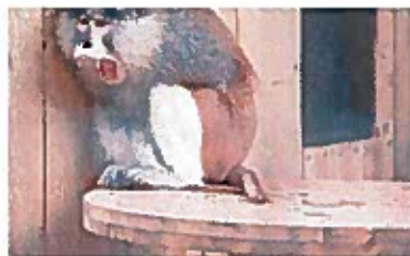
Wil, a 13-year-old patas monkey, lost part of his tail to frostbite in 2018 when his enclosure did not fully shelter him from cold weather.