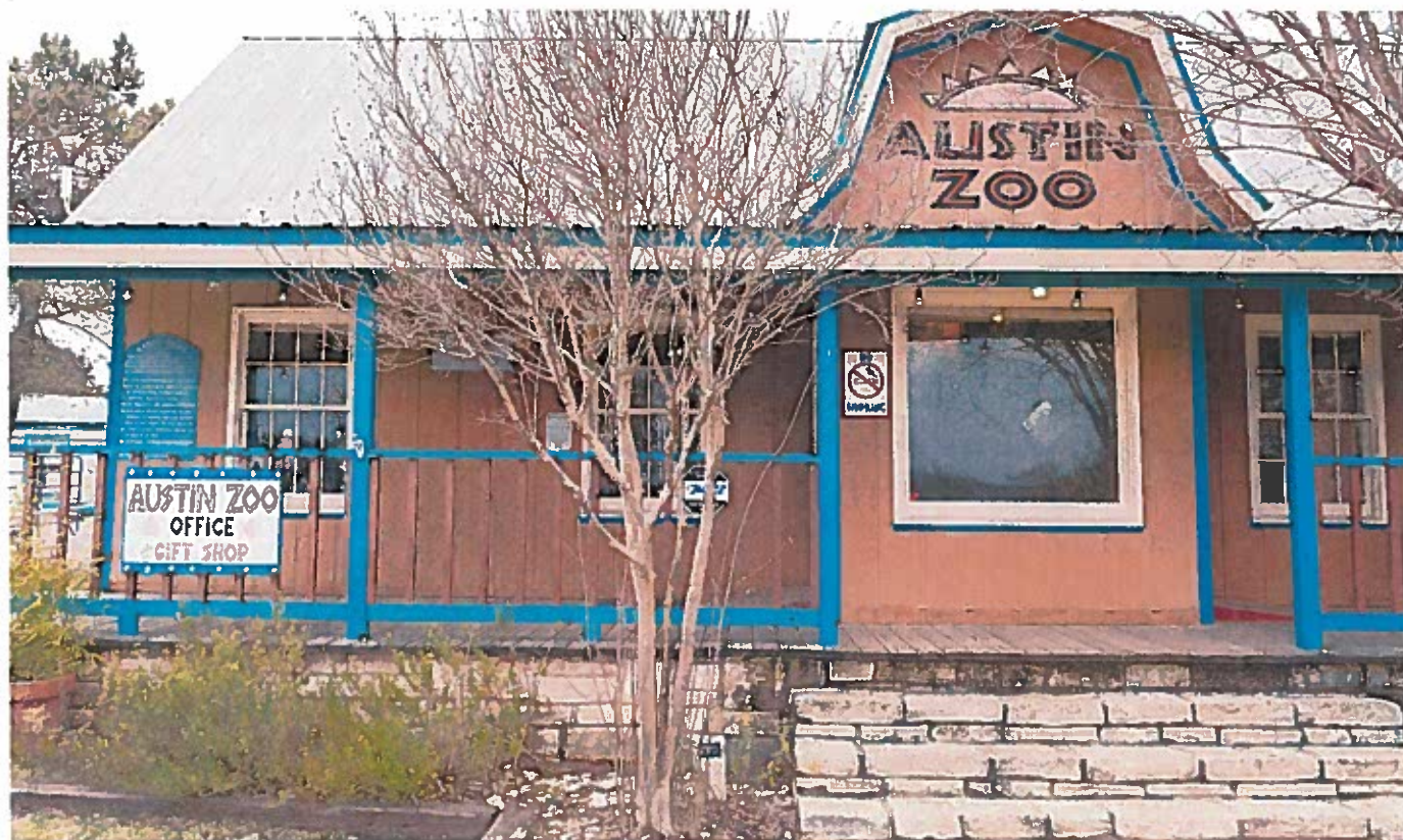
The Austin Zoo has more than 300 animals on 15 acres in the hills southwest of Austin. It made the transition from a goat farm to an animal rescue facility in the 1990s.