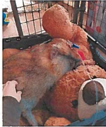
Annie, a patas monkey, went blind in 2010, was bitten by a rattlesnake and then suffered a series of strokes that left her partially paralyzed. Zookeepers tried to make her comfortable by setting her on stuffed animals.