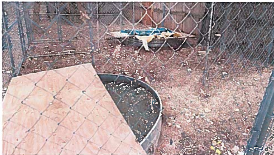
Two of the Austin Zoo's alligators live in stock tanks, where they're completely covered during cold weather months, without access to dry land or sunlight.