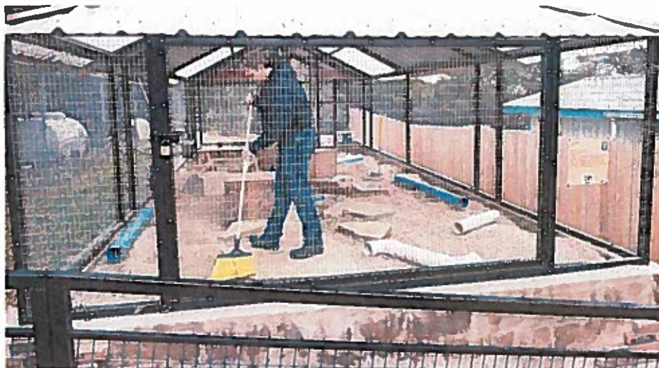
A zookeeper sweeps a recently constructed prairie dog enclosure Jan. 15. Multiple prairie dogs at the Austin Zoo died in the previous enclosure, which had high walls and sand instead of dirt.