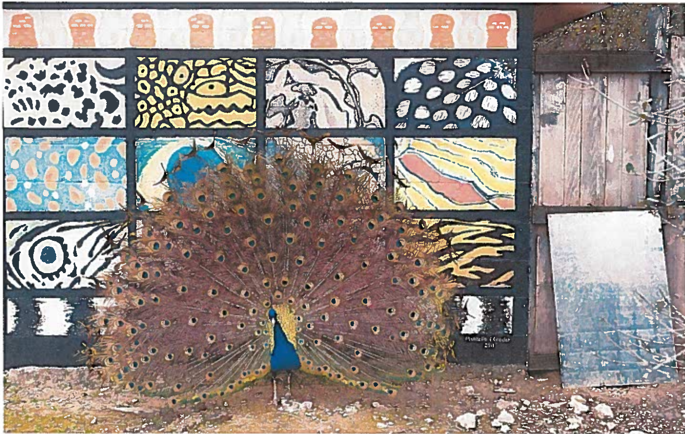
A peacock displays his colors as seen on the grounds of the Austin Zoo.