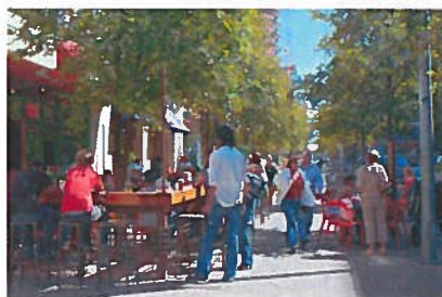
2 nd Street District