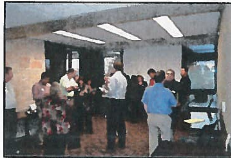
Mueller Contractor Fair

MBE/WBE Small Business Advisory Committee Presentation