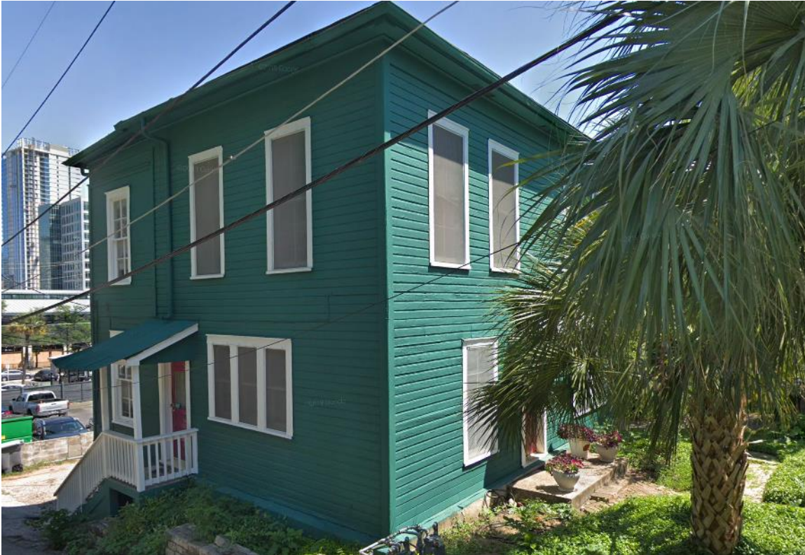
605 Baylor Street ca. 1915