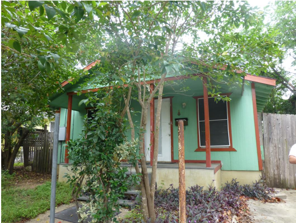
Primary (north) façade of 1207 E. 9 th Street.