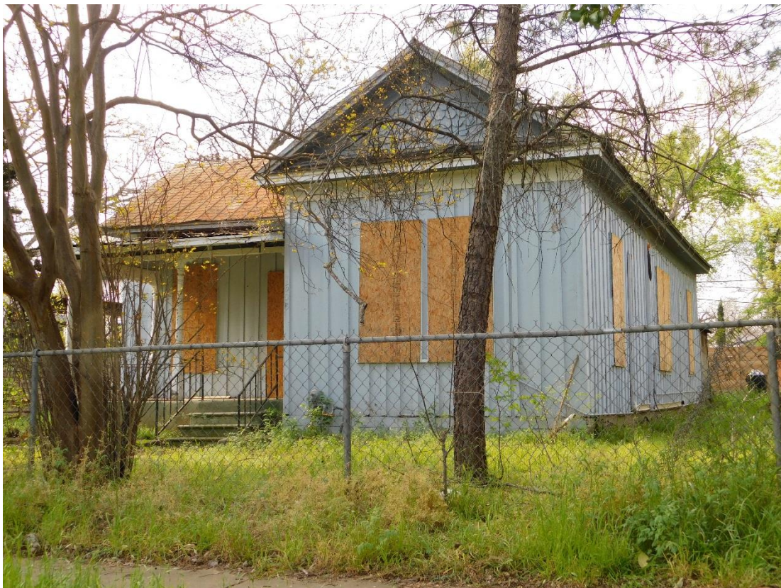
Photographs from March, 2019