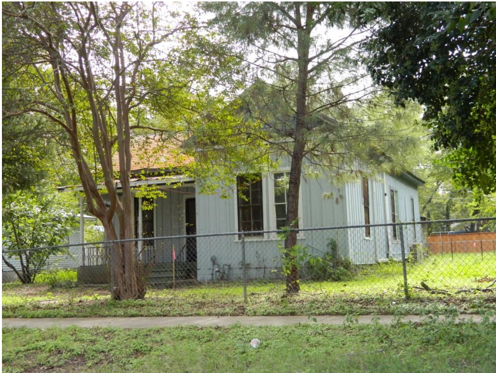
Photographs from 2015-16