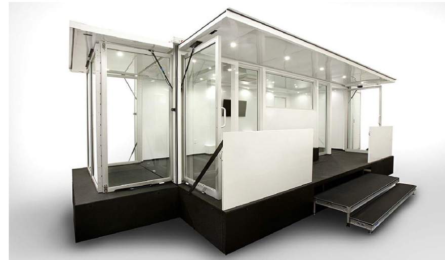
Proposed platform without customization