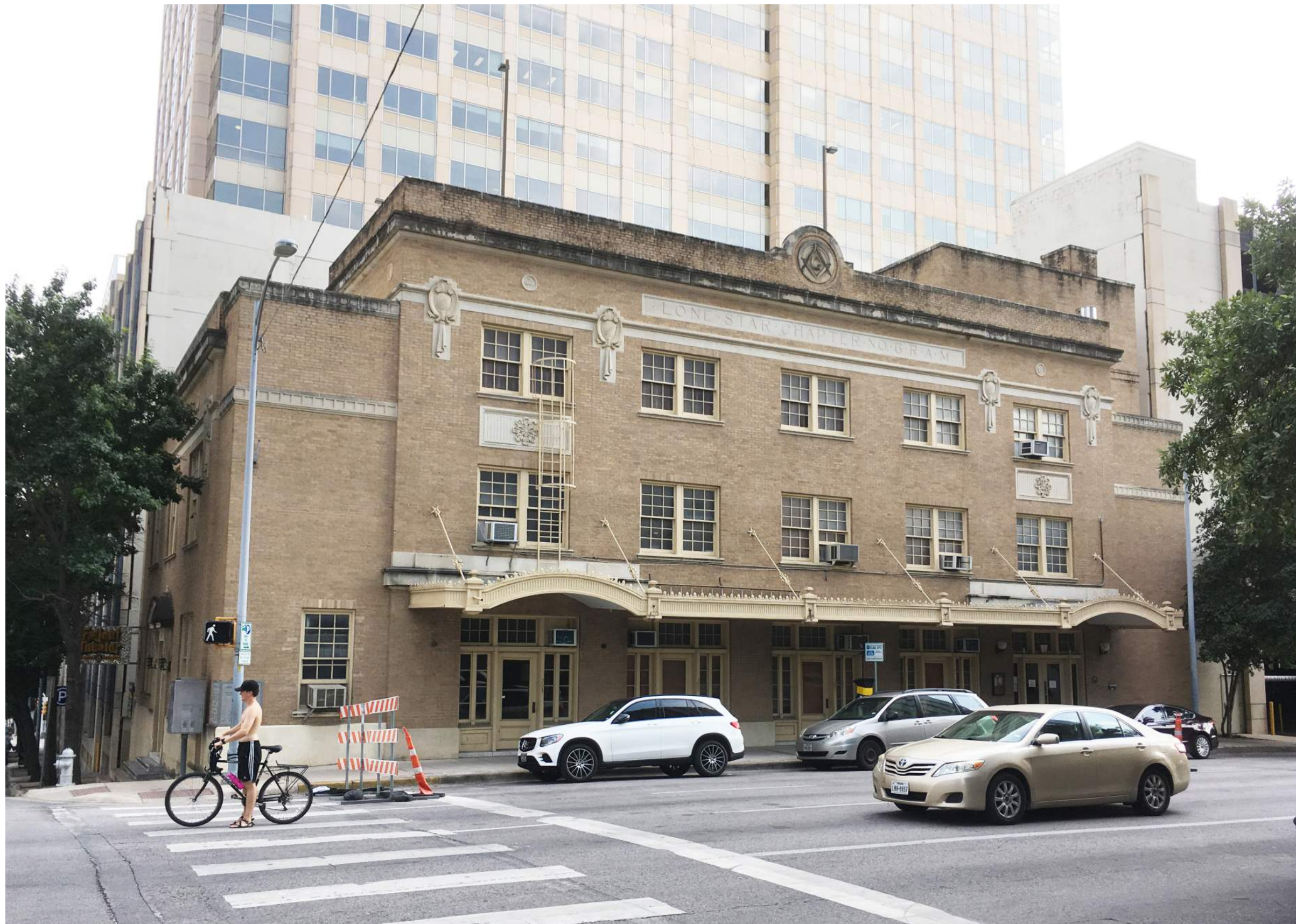
VIEW FROM W. 7th STREET - NORTH ELEVATION