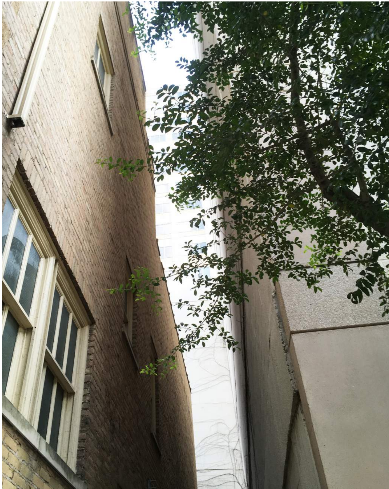
WEST ELEVATION, LOOKING UP