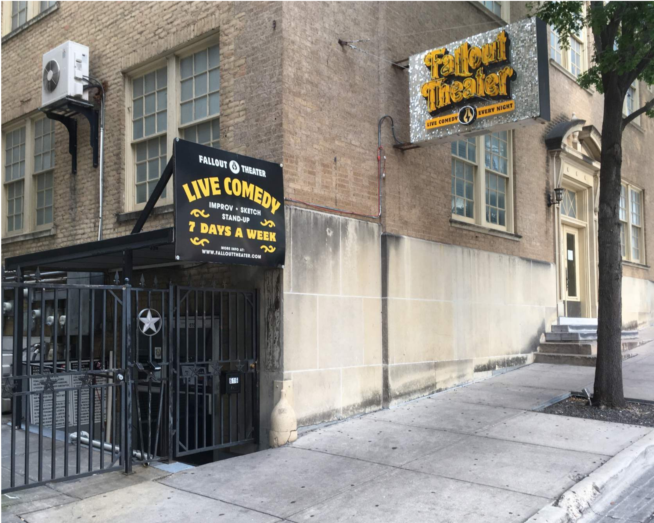
VIEW FROM LAVACA, SOUTHEAST CORNER