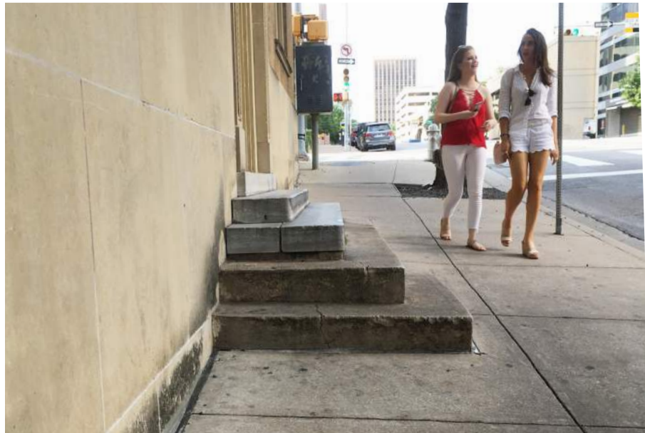
EAST STEPS, LOOKING NORTH