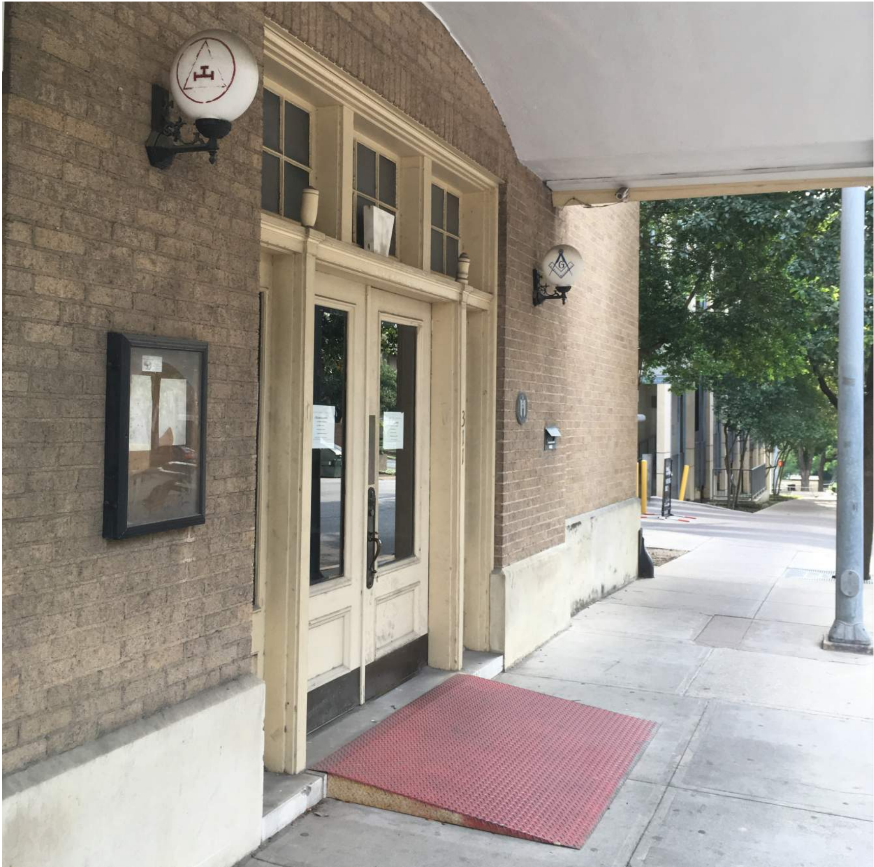
NORTH ELEVATION, MASONS' ENTRY