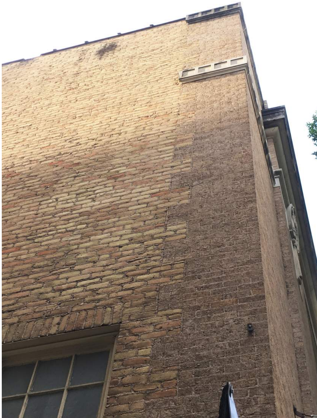
SOUTH ELEVATION SHOWING TWO TYPES OF BRICK