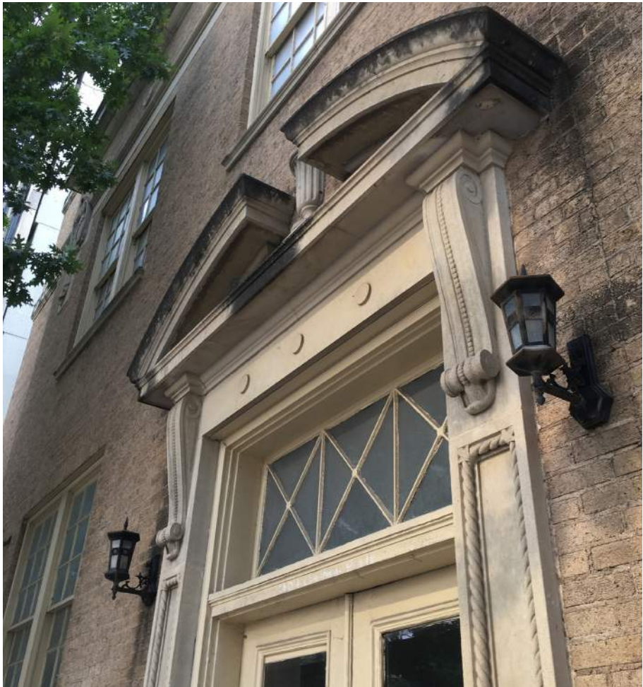
LIMESTONE DETAILING AT EAST ENTRY