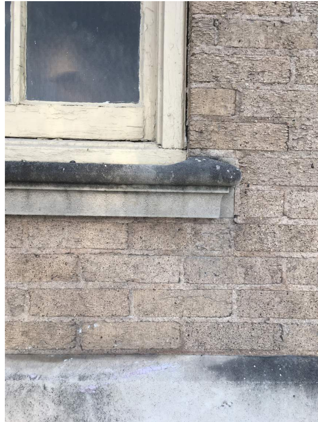
BRICK, STONE, AND WOOD DETAILS TO BE CLEANED AND RESTORED