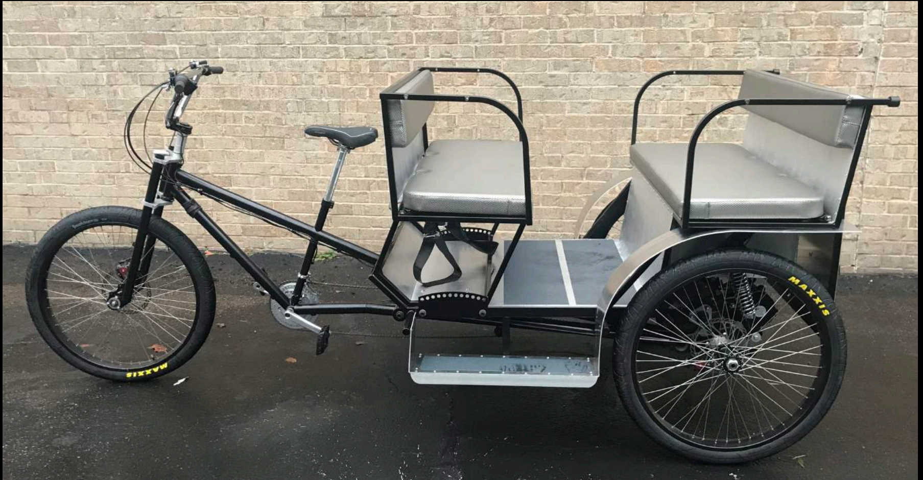
Movemint Bike Cab Austin, TX