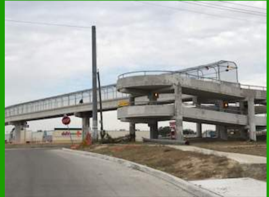
Over Hwy 183 at Springdale Rd. Austin, TX