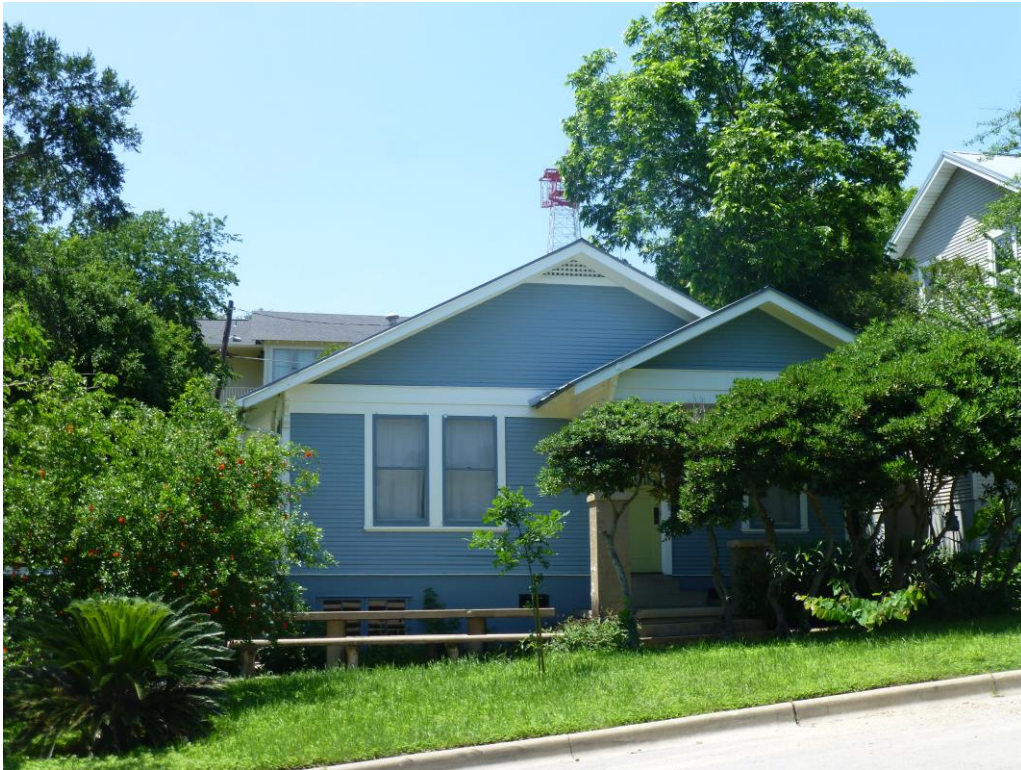
Primary (east) façade of 906 Maufrais Street.