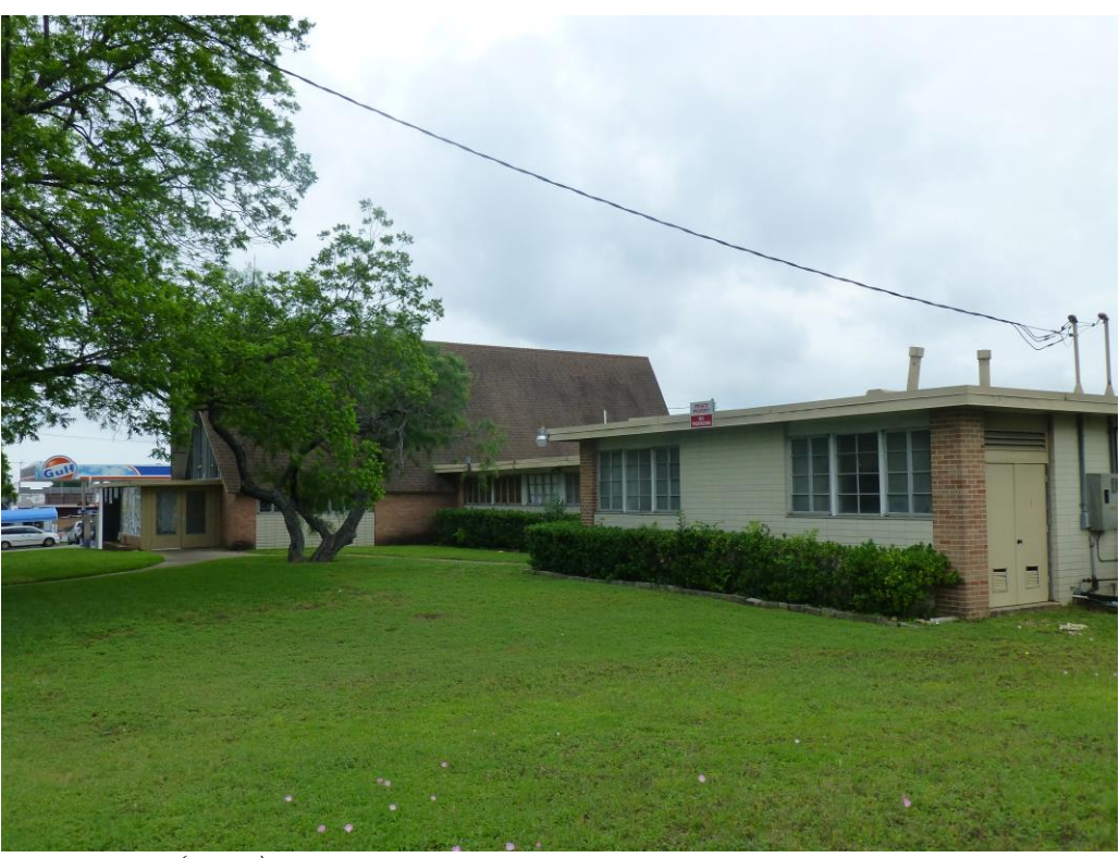
Primary (north) façades and west elevations of sanctuary, education building, and Fellowship Hall.