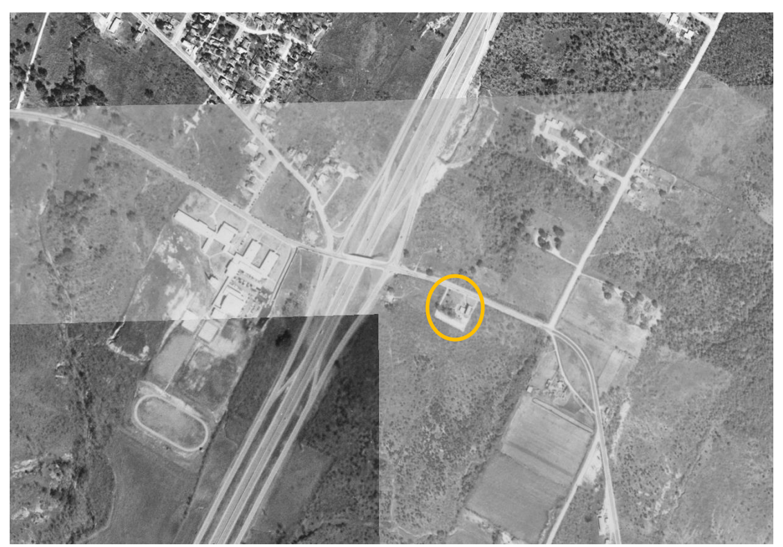
Aerial photograph, 1958. The property is circled in gold. By this time, I-35 had been constructed and Travis High School built. Residential development is still limited to the established neighborhoods of South Austin.