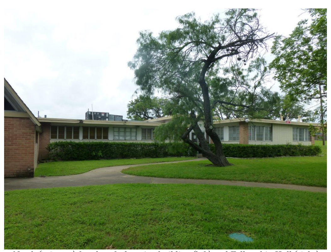
North (primary) facades of education building (left) and Fellowship Hall (right).