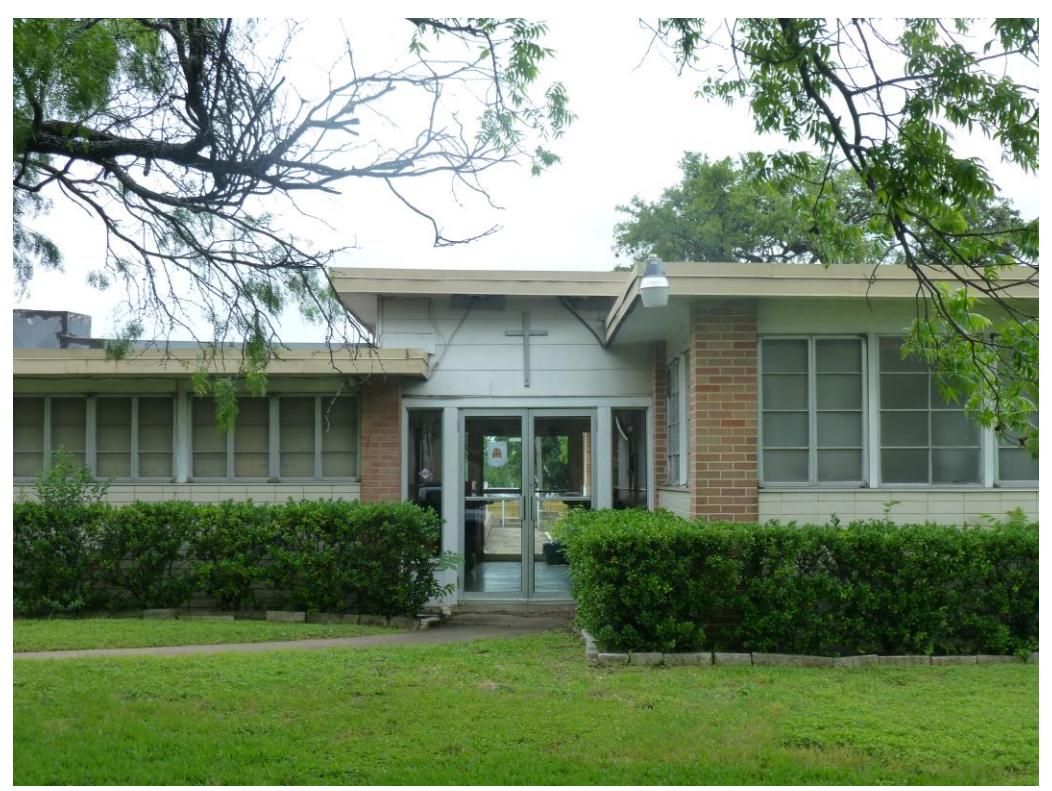
Detail view of hyphen between education building and Fellowship Hall.