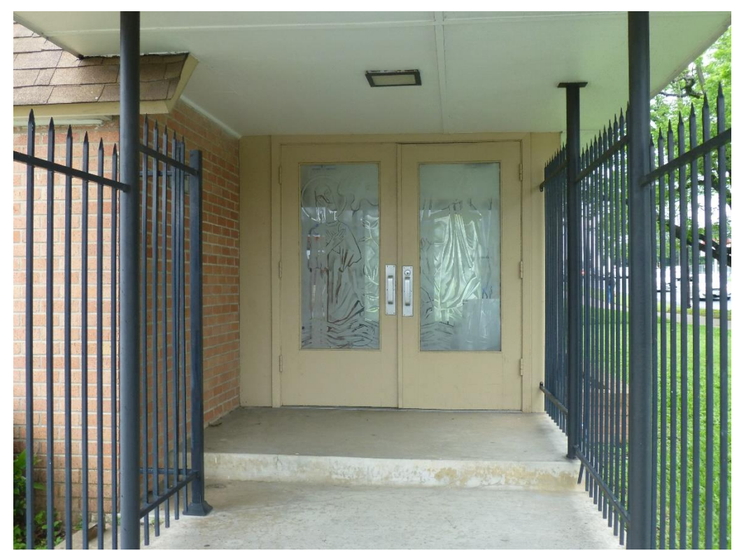
Detail view of vestibule entrance.