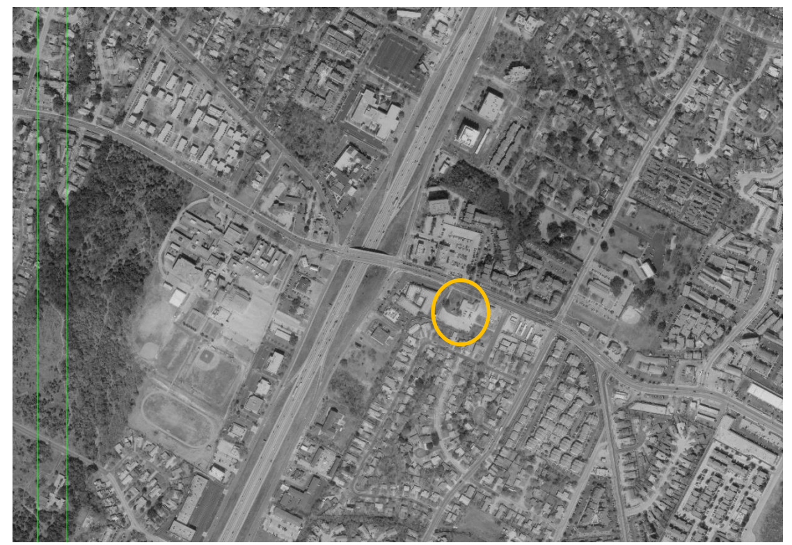
Aerial photograph, 1997. The property is circled in gold. This photograph shows an area that is largely built out with intensive residential and commercial development.