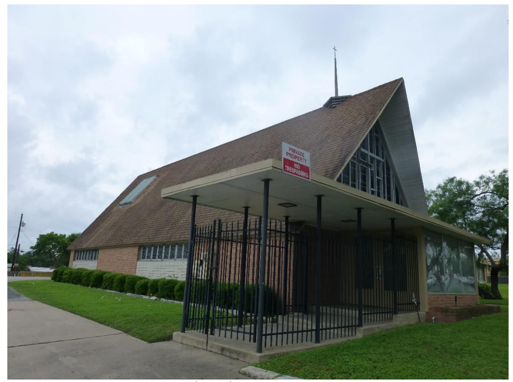
East elevation and primary (north) façade of Prince of Peace Lutheran Church.