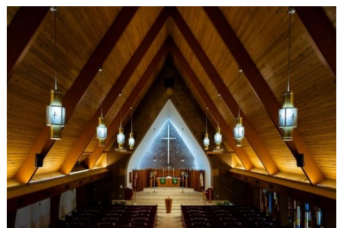
Immanuel Lutheran Church, Giddings (1960-61)