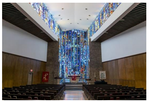
Gethsemane Lutheran Church (ca. 1963)