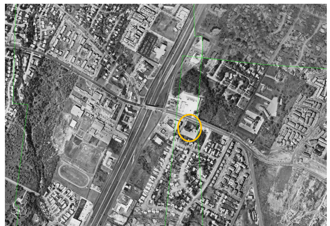
Aerial photograph, 1976. The property is circled in gold; an expanded parking lot is visible. This photograph shows a growing residential area to the north, south, and east, as well as west of I-35. Commercial development along I-35 has expanded from 1965.