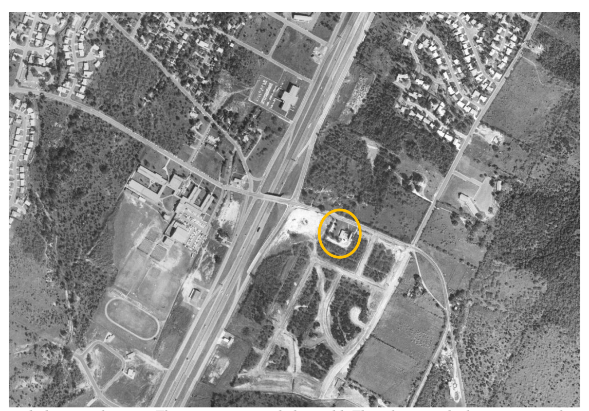
Aerial photograph, 1965. The property is circled in gold. This photograph shows new residential neighborhoods to the north, as well as a subdivision being developed directly south of the property. Commercial development has begun to spring up along I-35.