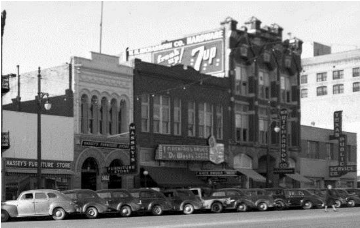
1946 photo of W.H. Richardson Co. store (2 nd from left).