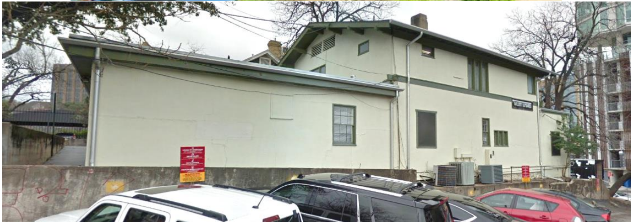
Main elevation, 2018; West elevation, 2017.