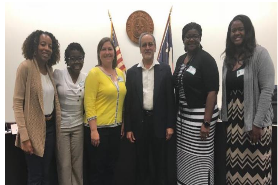
Texas Sickle Cell Advisory Committee