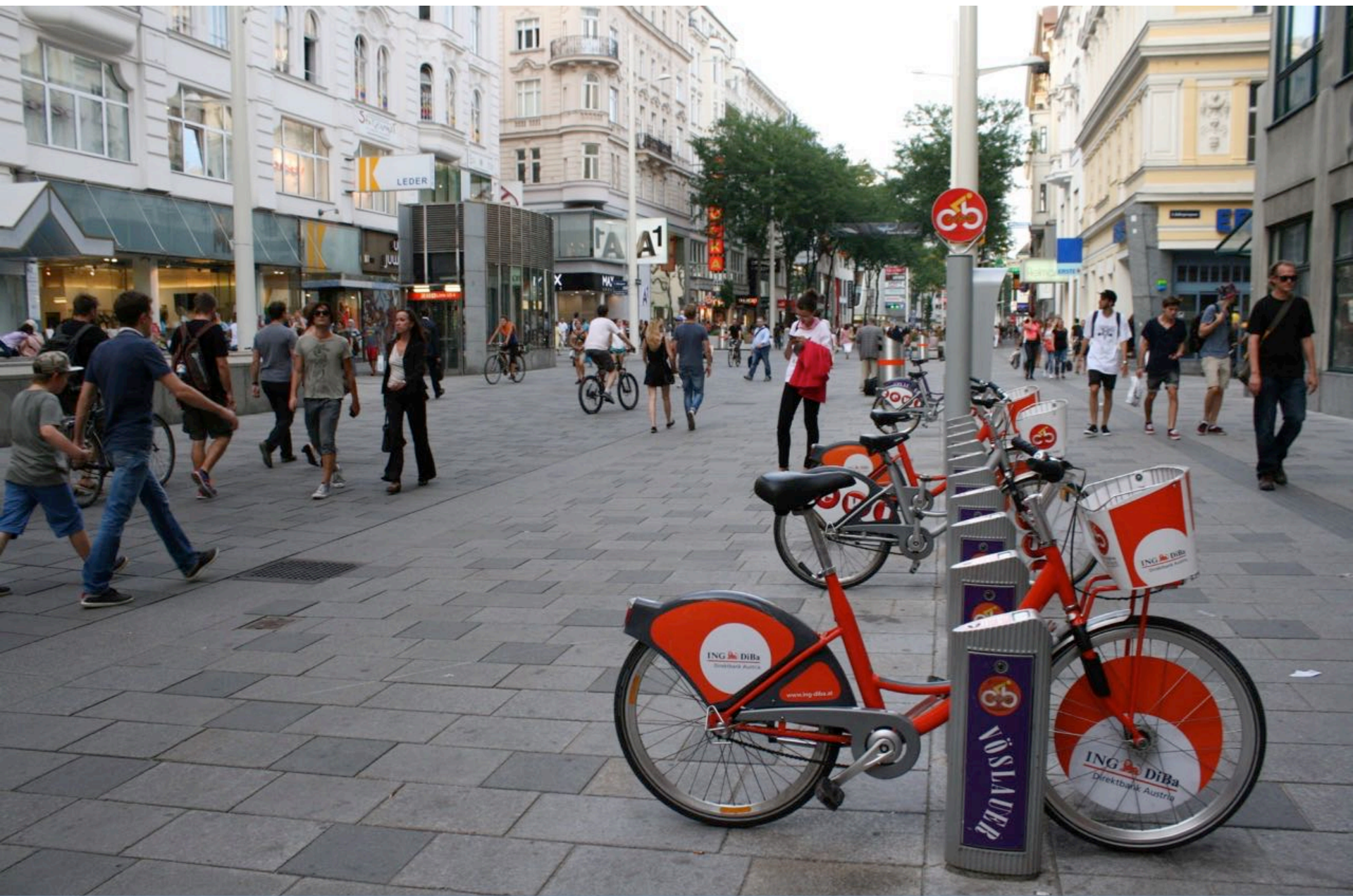
Pedestrians and bikes can mix when the street is properly designed