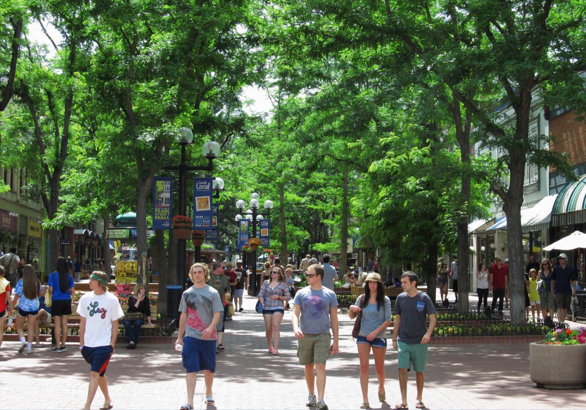
Boulder, Colorado today...