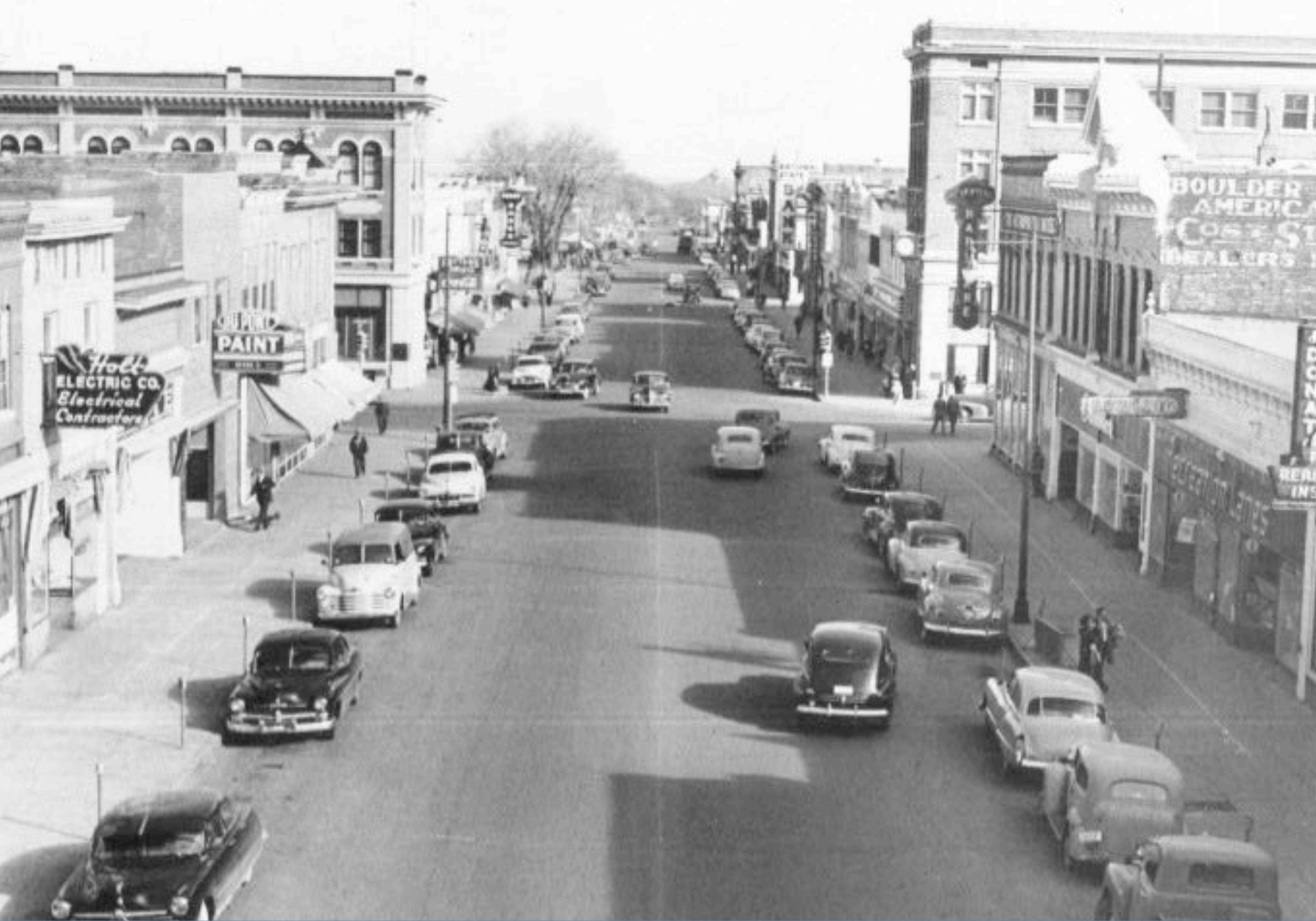
Boulder, Colorado in the past