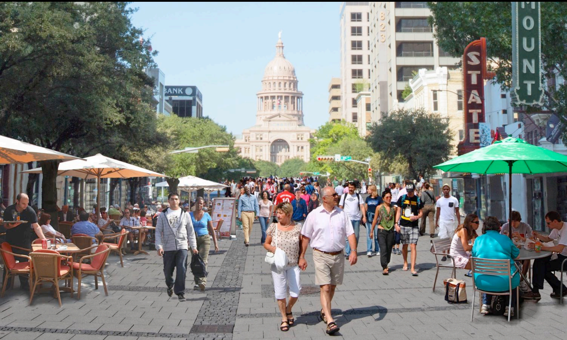
A car-free public space. More information on these ideas: Pedestrian Advisory Council's May 2019 recommendation