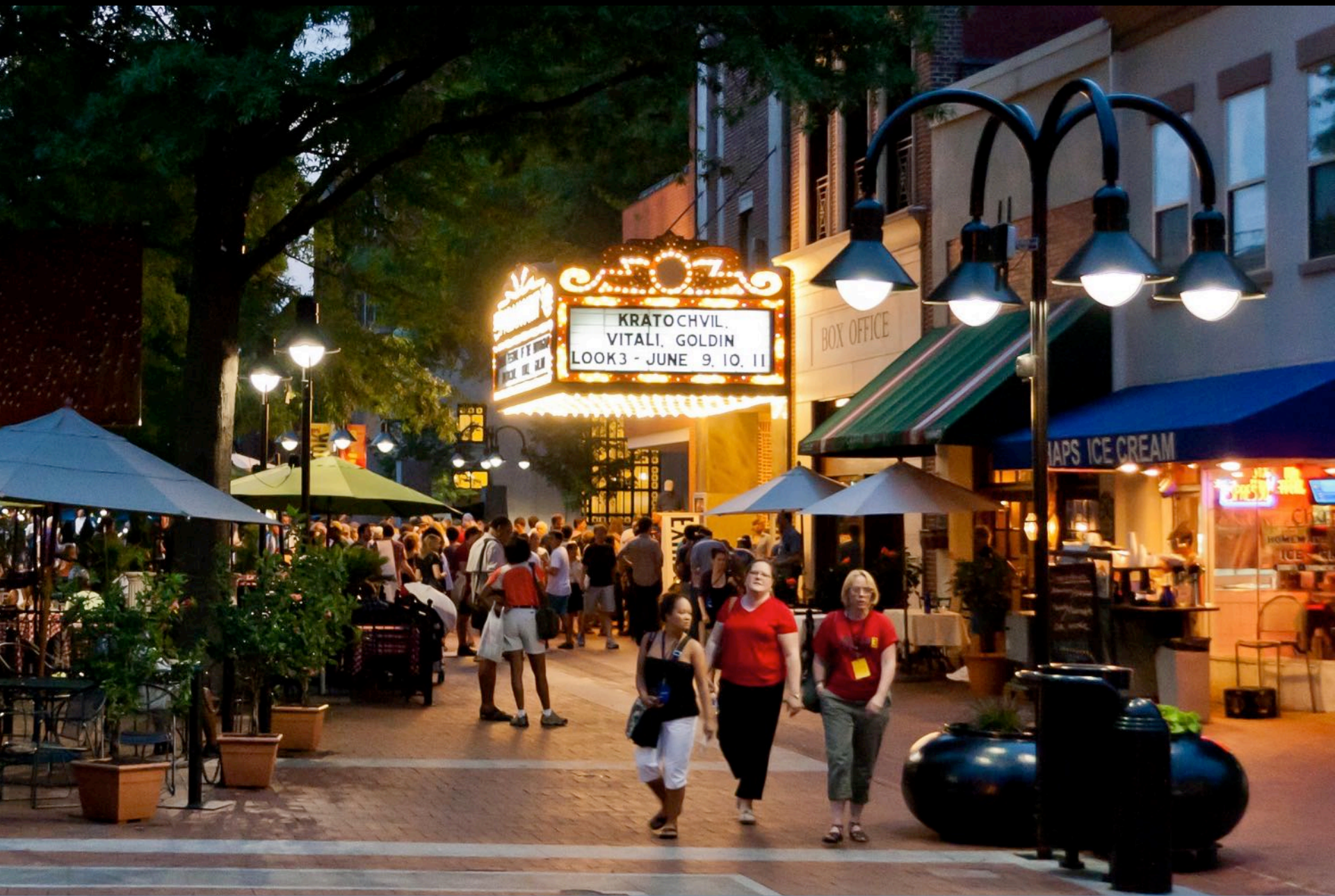
Charlottesville, Virginia today...