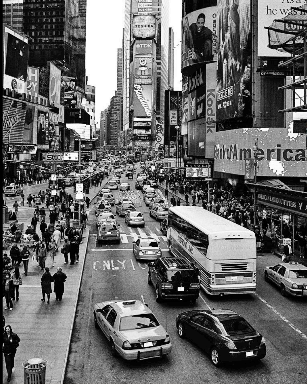
Many world-class cities turned auto-streets into pedestrian-only public spaces. For example, New York City in the past...