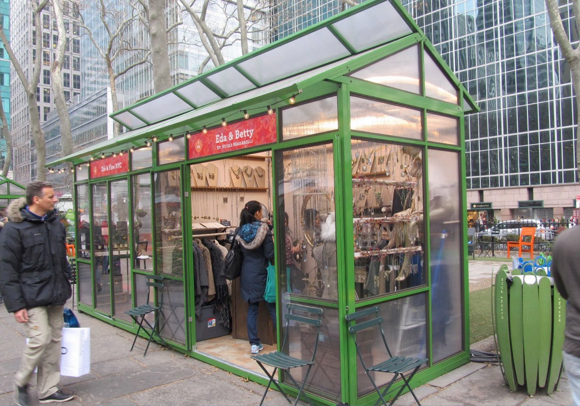
These kiosks are used at the Winter Village event in Bryant Park, midtown Manhattan