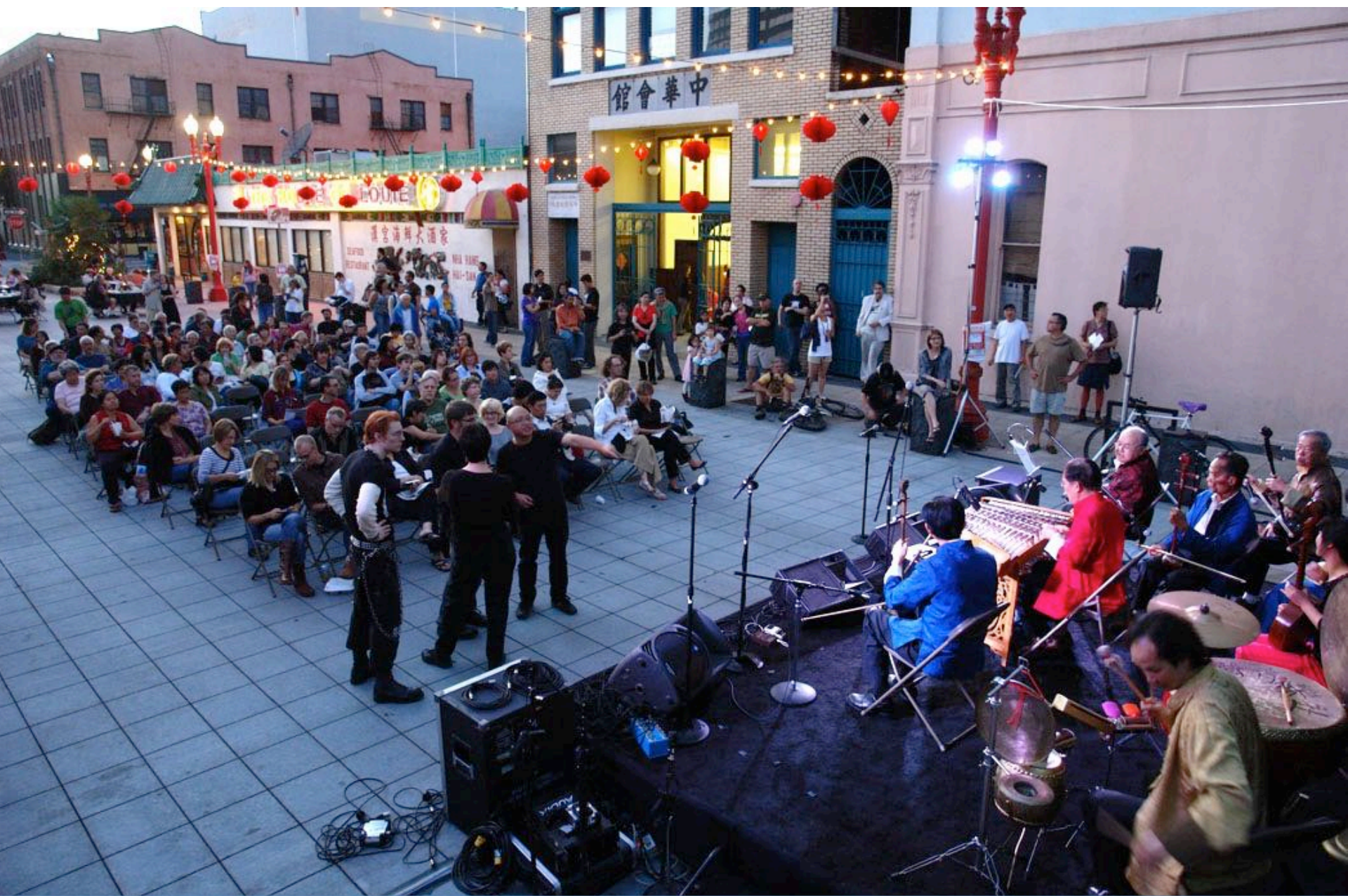
This “Festival Street” in Portland OR is designed to make closing the street to traffic easy