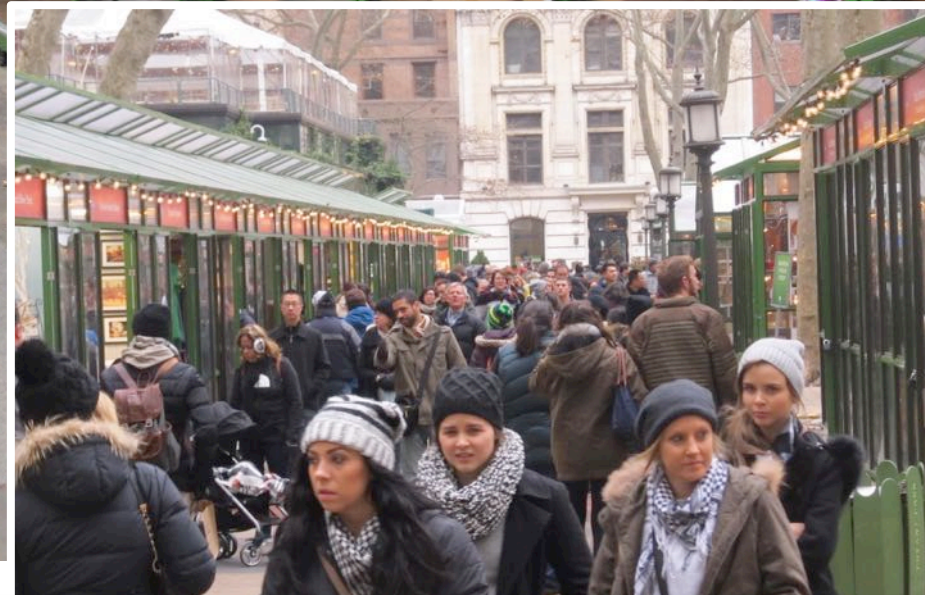
These kiosks can house uses such as small businesses, and they define space well