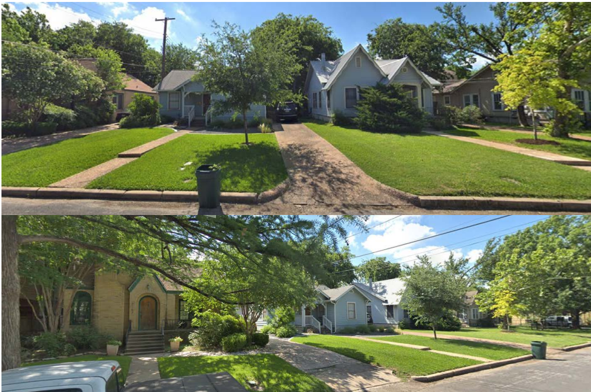
Streetscape and adjacent structures

City Directory Research, Austin History Center