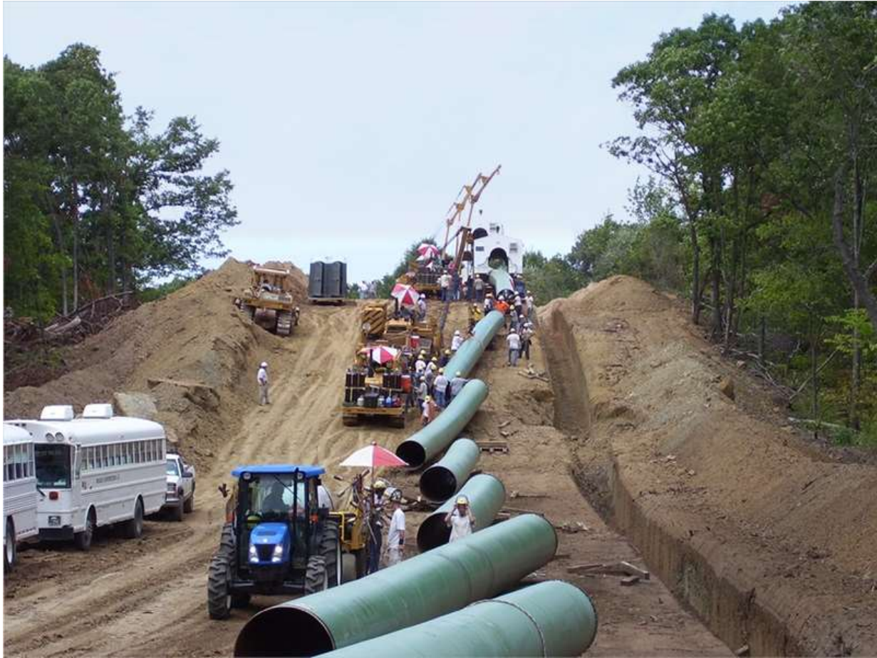
Figure 2: Photo of construction of a representative 42-inch pipeline in a 125-foot wide easement.