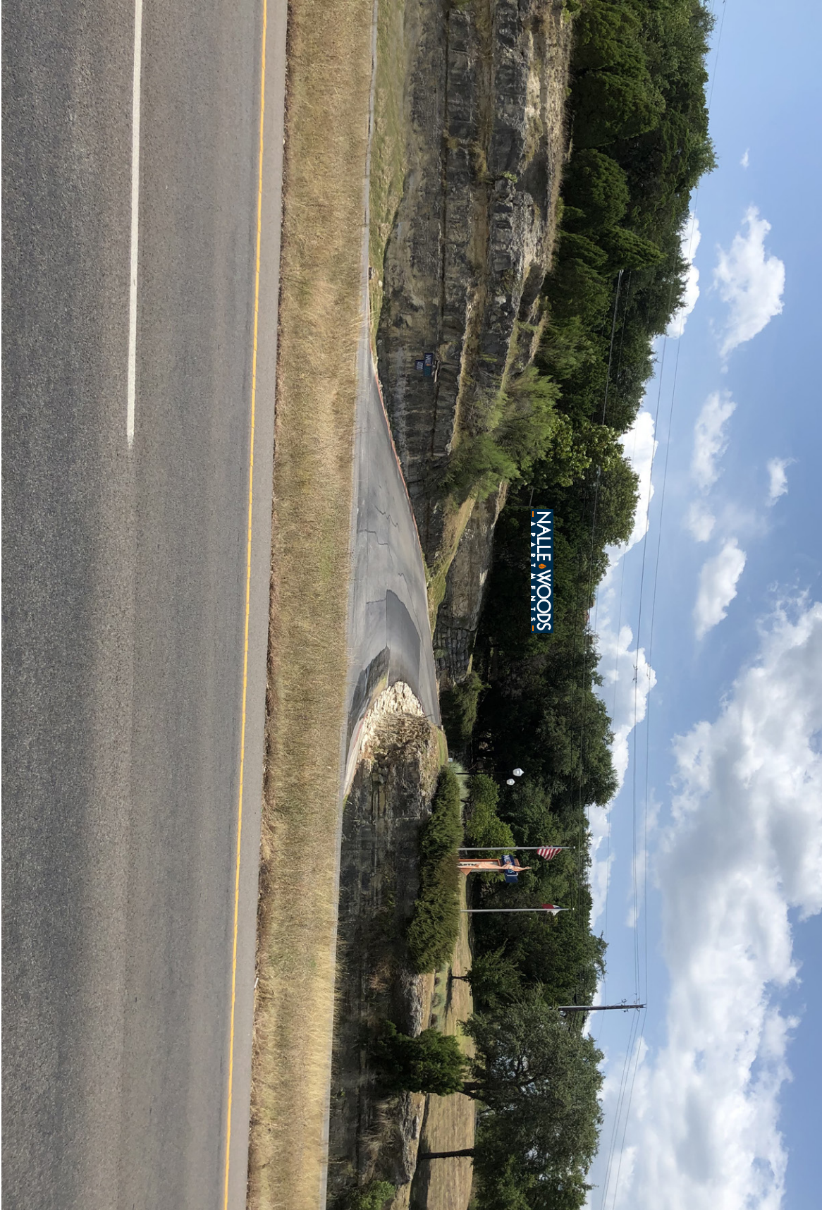
EXHIBIT 11 - PROPOSED SIGN, SEEN FROM NORTH BOUND LOOP 360

4700 N Capital of Texas Hwy, Loop 360 Austin, TX 78746