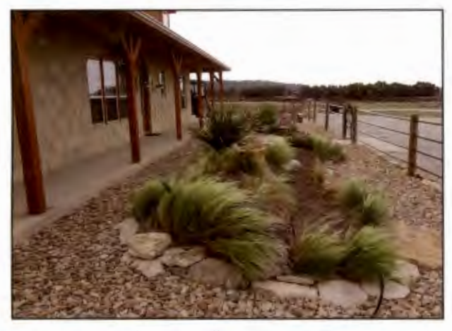
Native xeric landscaping allows water-wise practices to create a landscape that will flourish in hot and dry conditions.