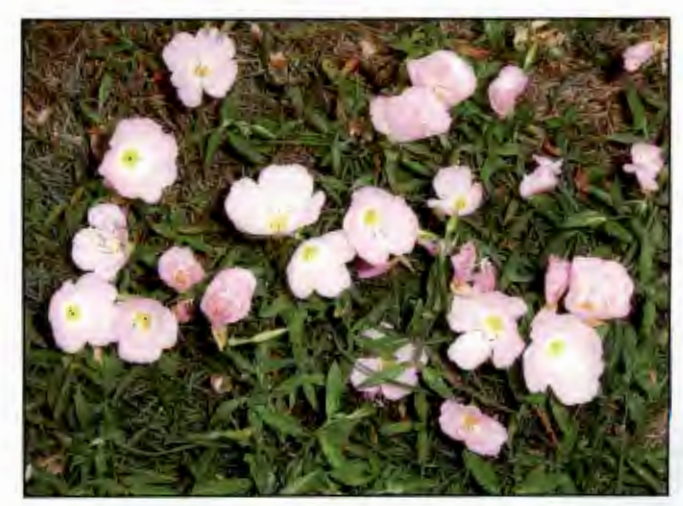
Mexican primrose, a low growing plant, helps maintain the vertical separation of fuels.