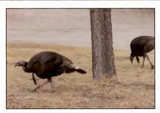
Landscaping provides habitat for wildlife.