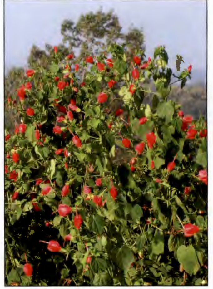
The low oil content of Malavaviscus "Big Momma" makes this plant less flammable.