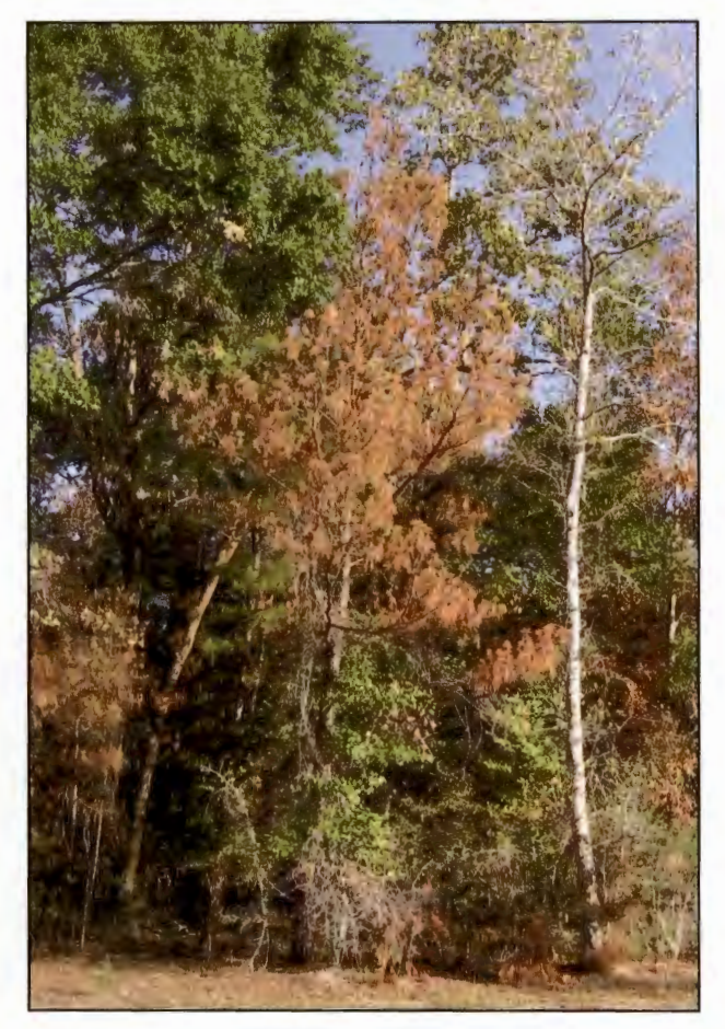
Ladder fuels allow ground fires to spread to the crowns of trees. Once in the crowns, a wildfire is very hard to stop.

Plants placed so that a fire can spread to your home increase the chance of your home receiving direct flame and embers as the fire spreads. Your home is a continuation of the fuel. Creating "defensible space" will greatly reduce your home's risk to wildfire.