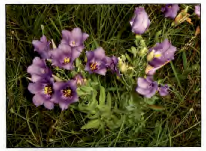
The high moisture content of the Texas bluebell makes it slower to ignite.

Less dense plants produce less material to burn, while more compact fuels produce more fuel to burn.