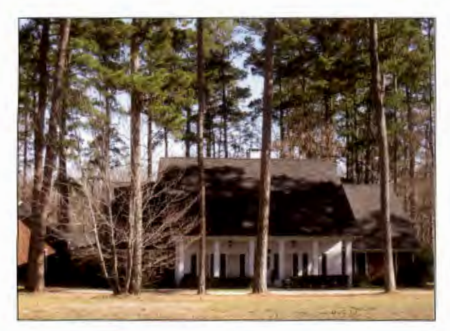
Landscaping reduces energy cost by providing shade for the home.

Firewise landscaping can be achieved along with other landscaping goals of landowners. Creating a safer Firewise landscape can easily fit into multiple goals just by using the right plants and proper spacing.