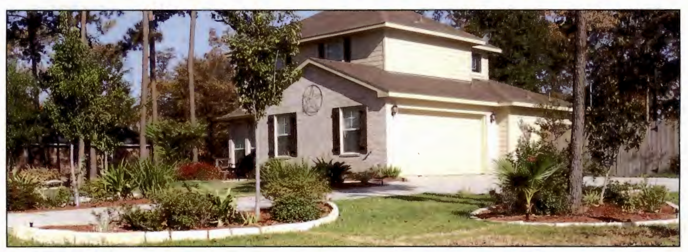
Island landscaping allows for space between fuels and will slow the spread of fire.

In Firewise landscaping, choose design elements using vertical and horizontal separation of plants. The most important portion of the home ignition zone is the defensible space. Highly flammable plants should be removed or isolated. Plants or plant groups should be placed using vertical and horizontal separation, breaking up the fuel continuity. Also remove dead and dying plants and plant materials.