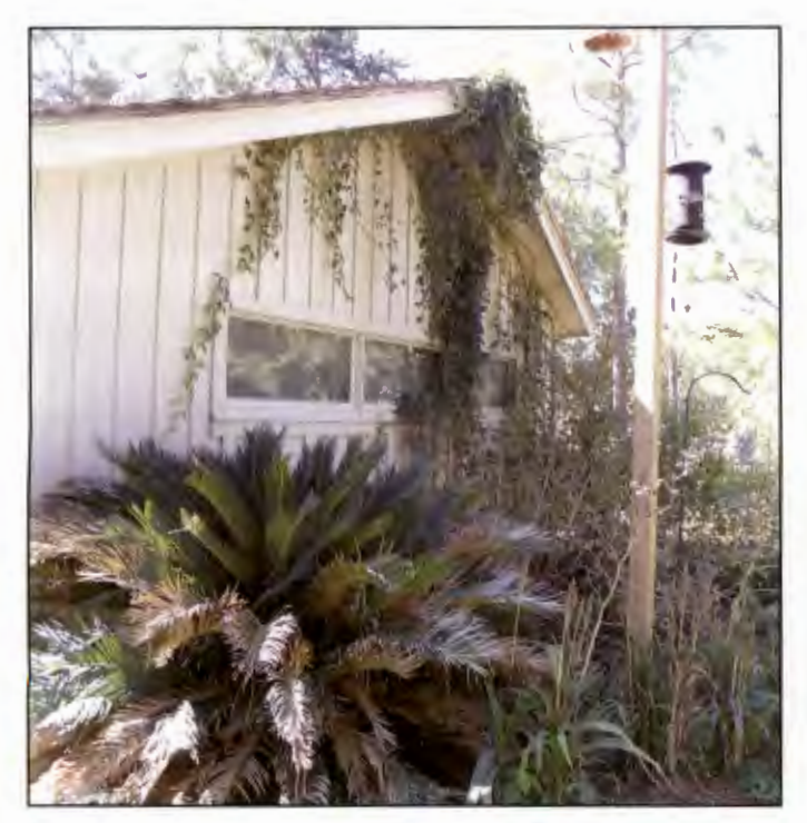
Overgrown vegetation that is within the 30 feet of defensible space can produce significant heat, potentially igniting the home.

Decks and siding easily can ignite when plants that burn quickly and produce high heat are placed adjacent to the home. A burning plant or group of plants in front of windows can cause glass breakage allowing fire to enter the home. Taller flames adjacent to the home can enter through the soffits. These flames may reach combustible materials and cause material failure, such as gutter or siding that melts, exposing the wood.