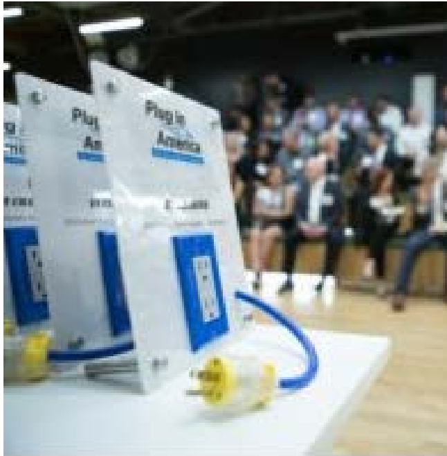
Plug In America Drive Electric Award