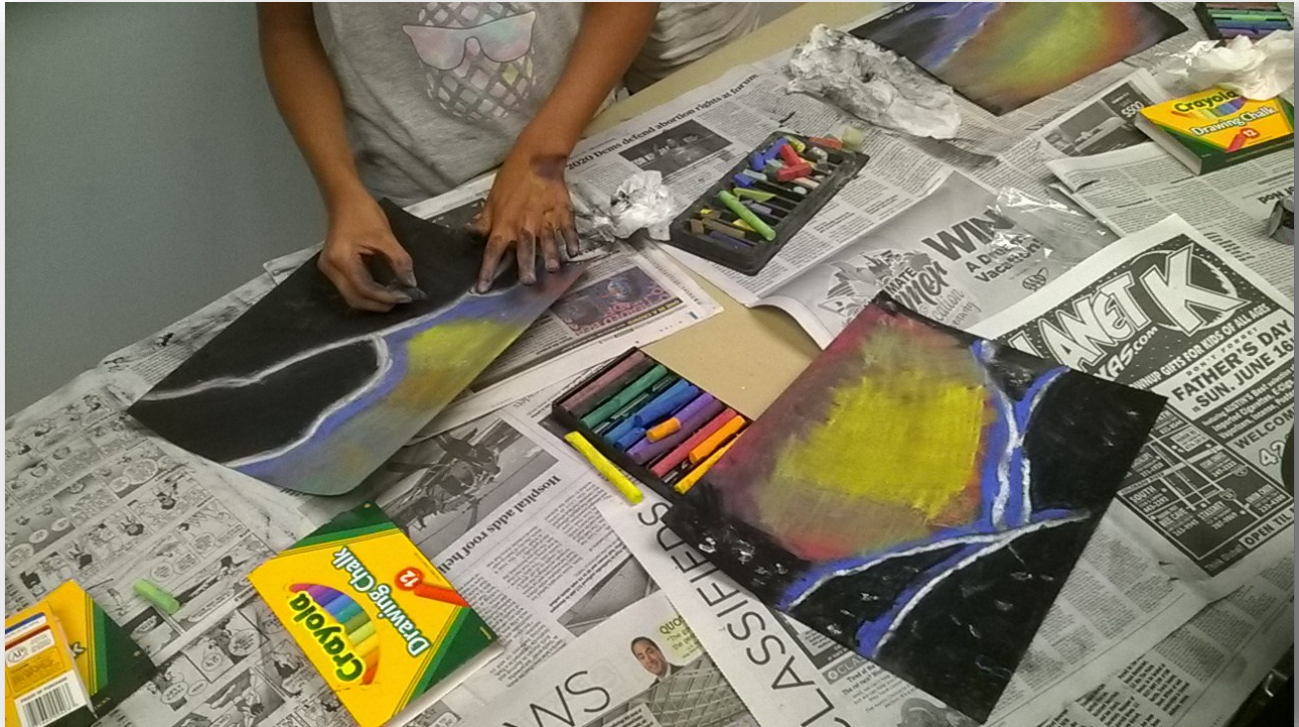
Galaxy Art Program

We really expanded our Tween programs this year and got a fantastic response from the public. Programs were almost completely created and ran by staff members. We held a series of Science Art programs including Galaxy Bracelets, UV Resin Jewelry, and Glow in the Dark Art. We held Percy Jackson Parties, Fortnite Parties, and sewed fantastic felt creatures while we watched movies. There were also artists in residence doing fiber art and visiting artists doing pop art. All that and more!