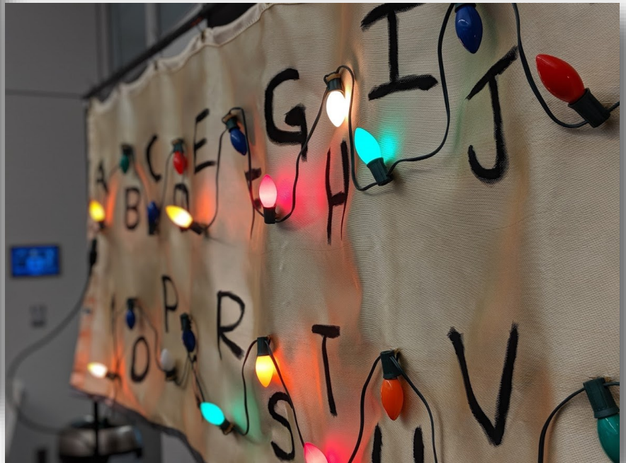
Stranger Things themed Escape Room Program

We worked closely with our Teen Councils this year to develop programming that reflected things they wanted to learn, experience, and participate in. This resulted in amazingly diverse programming that appealed to a variety of teens.