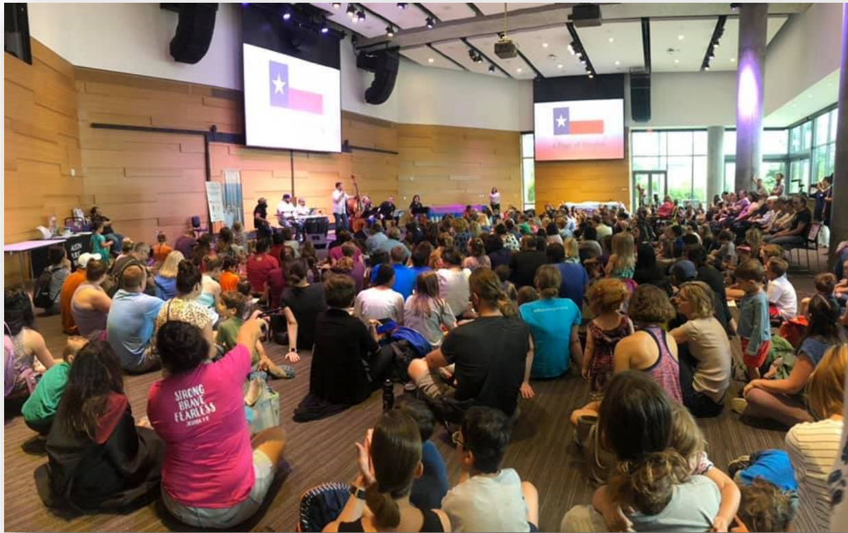
Austin Symphony Art Park

7 programs at Central with 6,494 attendees