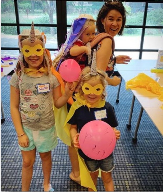
Super Narwhal and Jelly Party