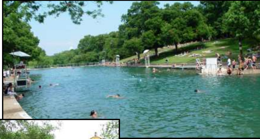
Barton Springs Pool Master Plan assessments