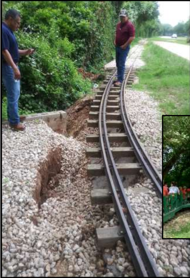
May 2019 storm damage