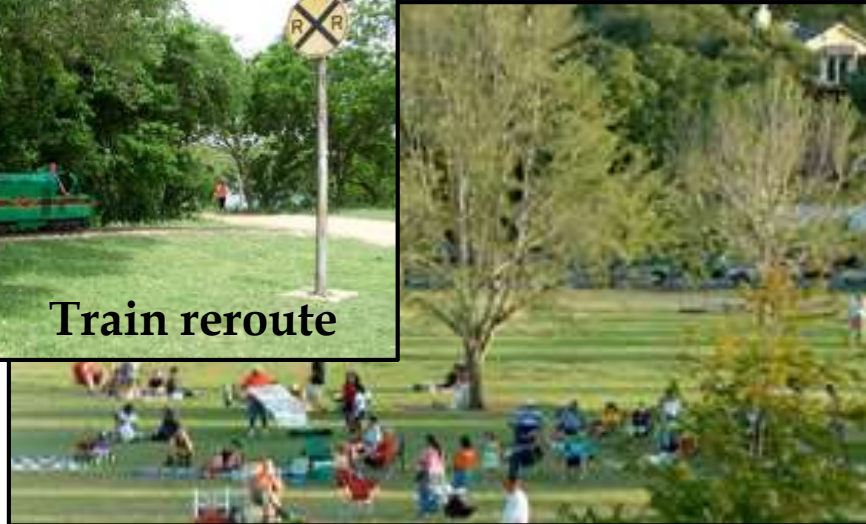
Zilker Park Master Plan development in progress