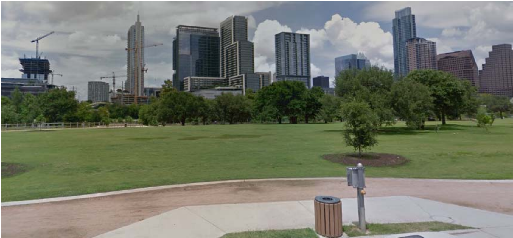
Auditorium Shores 2017 – Existing Conditions