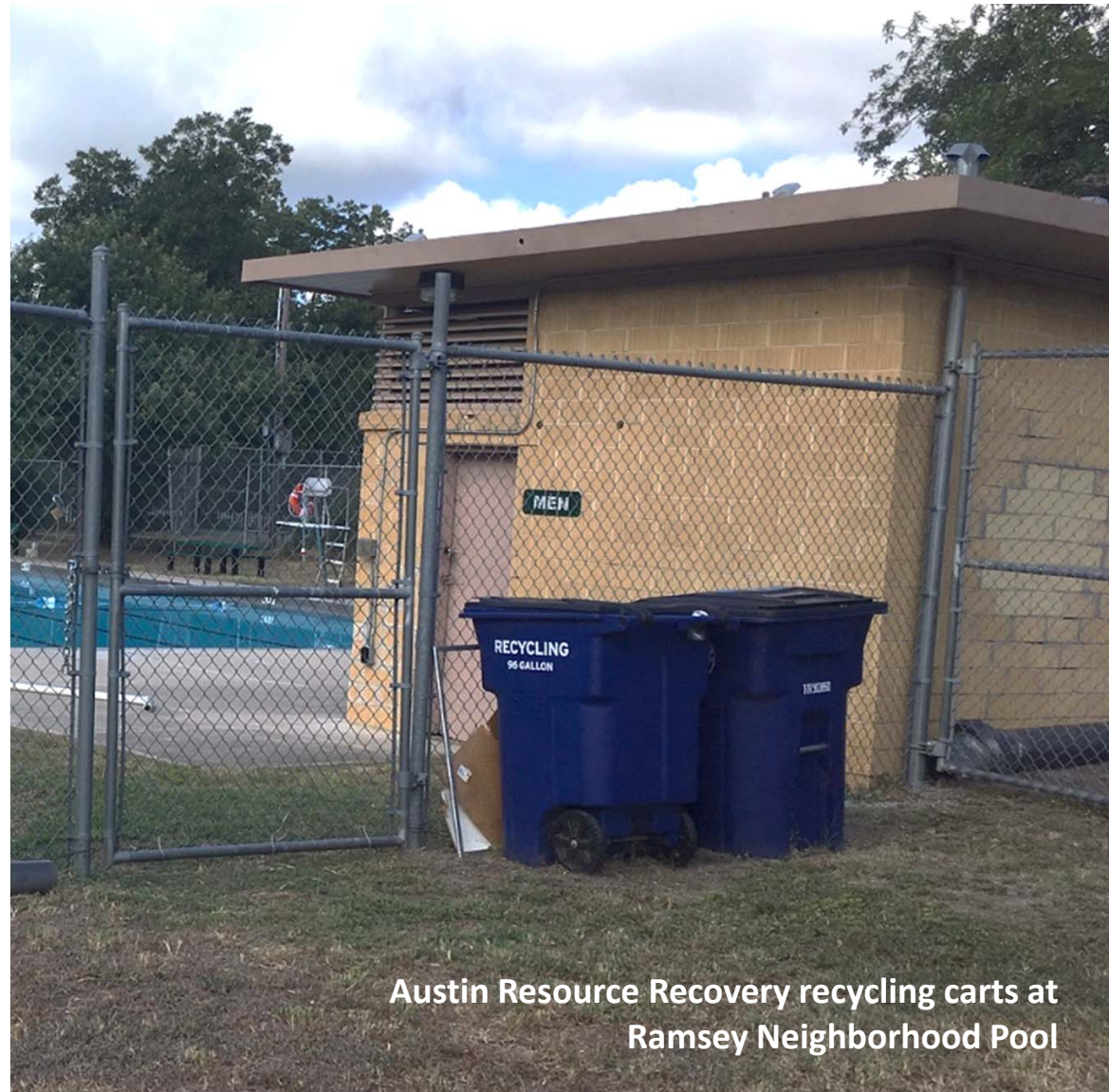
Austin Resource Recovery recycling carts at Ramsey Neighborhood Pool