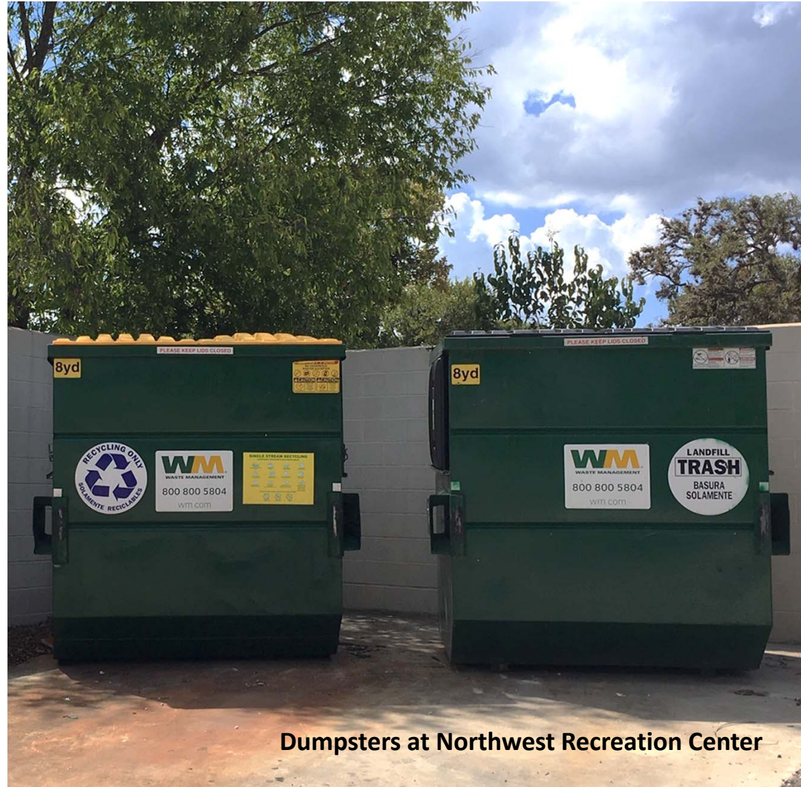
Dumpsters at Northwest Recreation Center