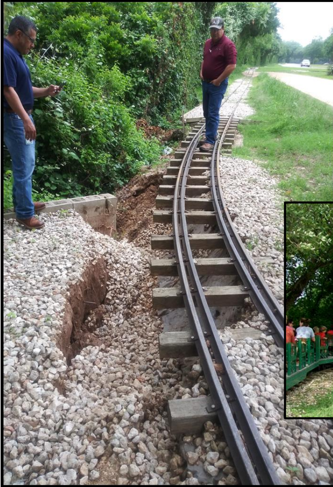
May 2019 storm damage