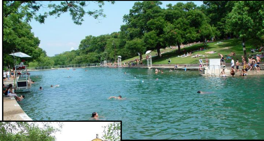
Barton Springs Pool Master Plan assessments