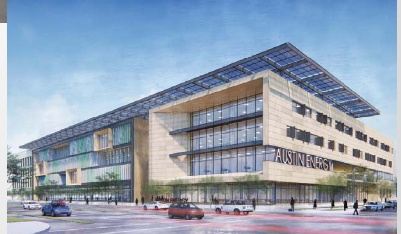
AEHQ – Complete April 2021