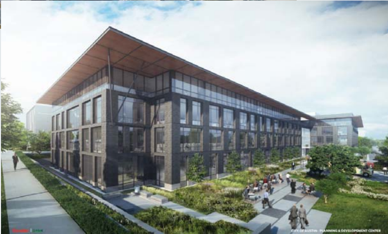
PDC – Complete May 2020