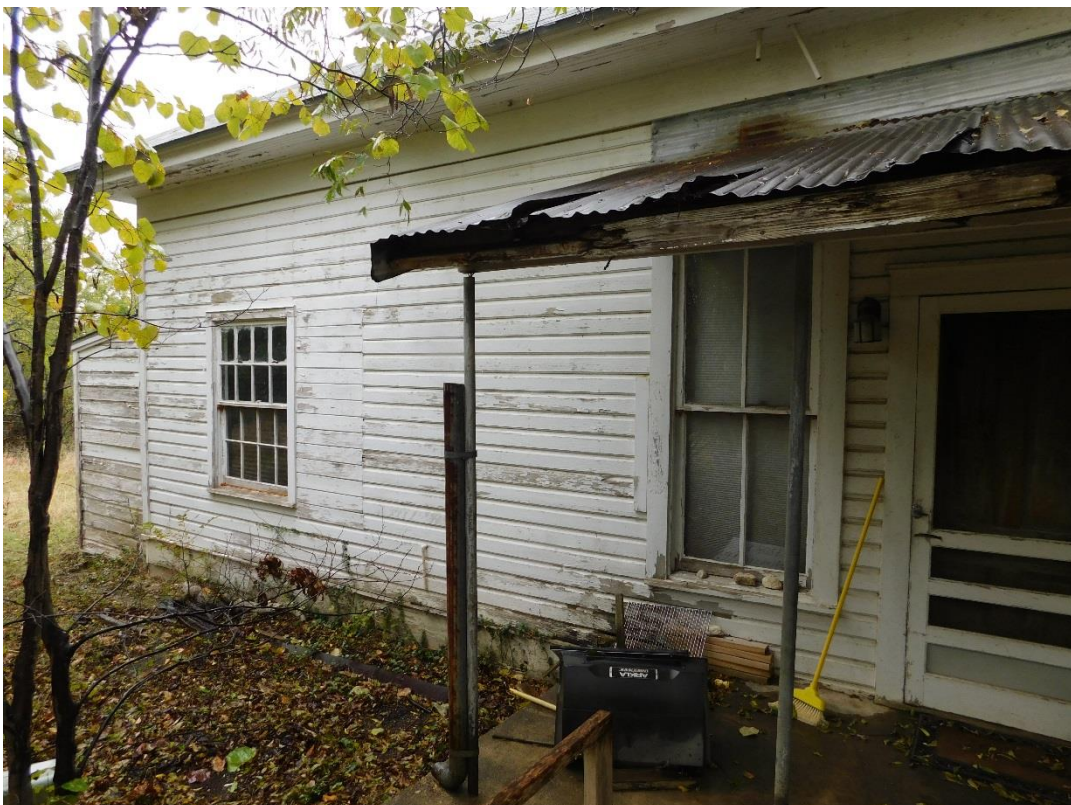
Frame additions on the west elevation of the house showing a what appears to be a 1910s addition (with the door) and a later addition to the left.