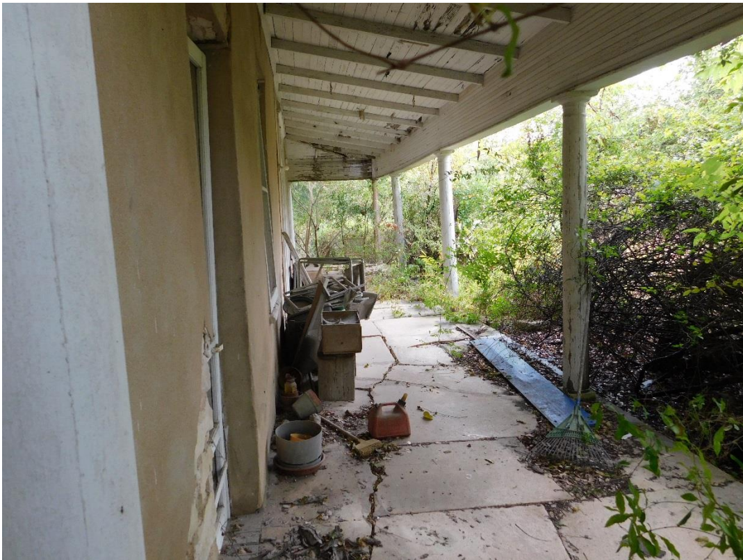
Full-width porch along the east side of the house. The porch is believed to date from the 1910s.