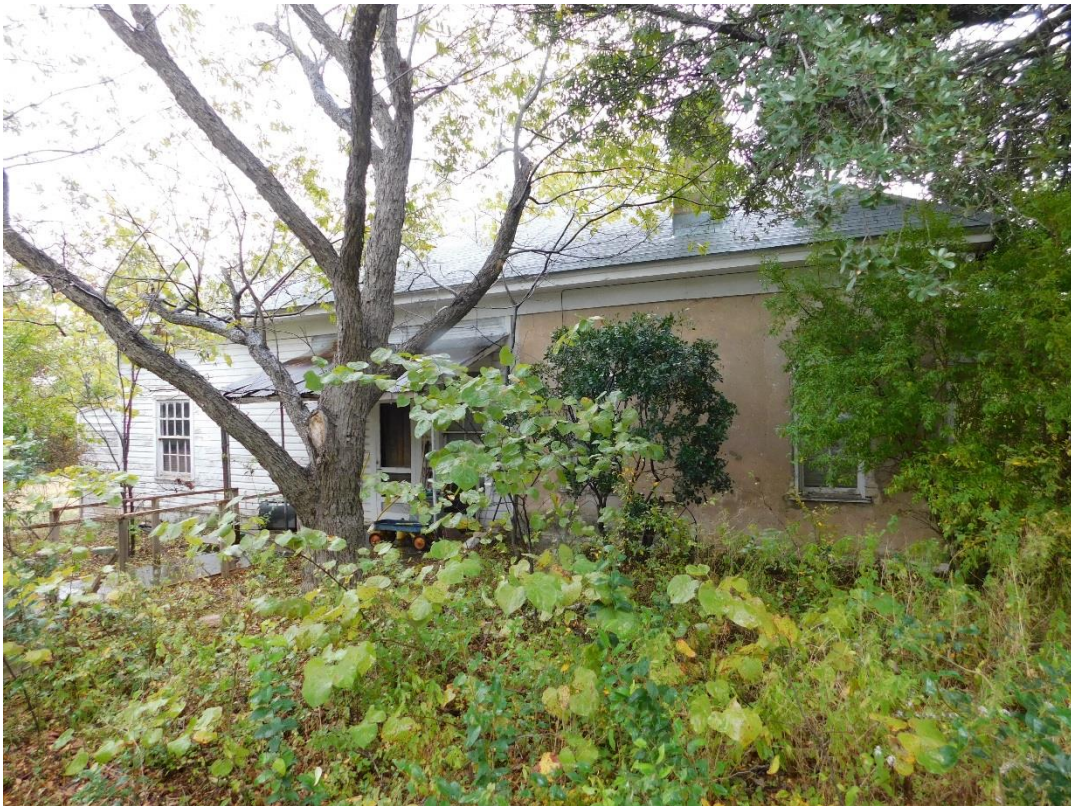
West elevation of the house showing the stuccoed stone section and the frame additions.