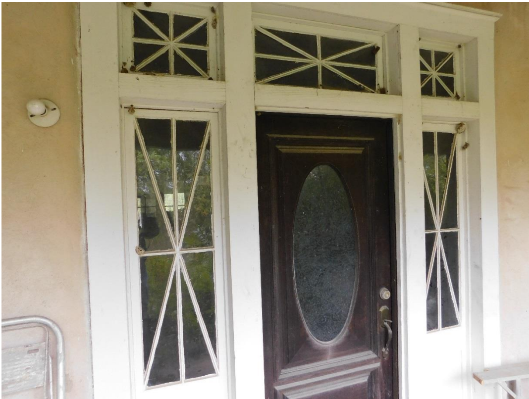
Neo-Classical-styled entry on the east elevation of the house – believed to have been constructed in the 1910s.