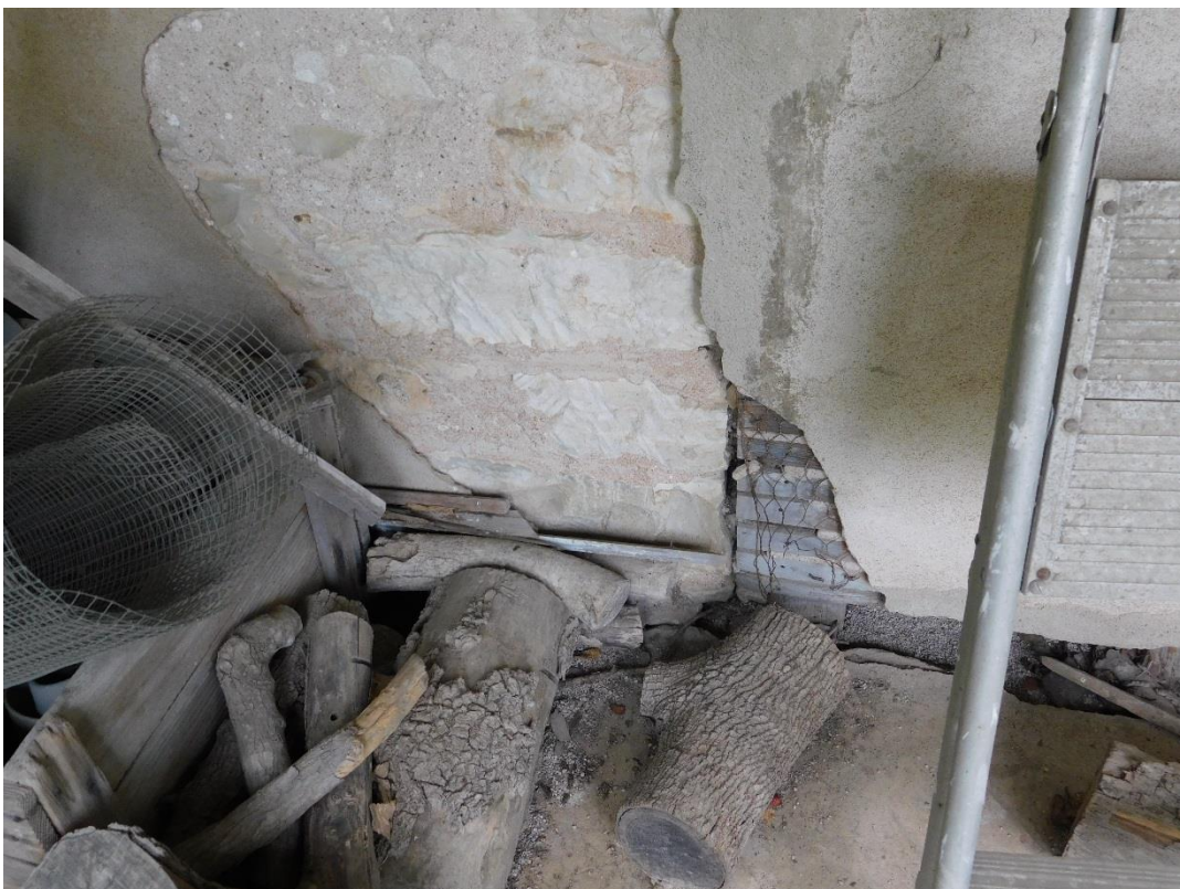
Photo showing the stone section (left) and the lathe section of the 1910s addition under the stucco on the east elevation of the house.