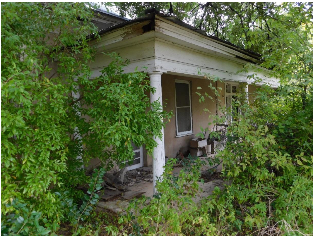
Neo-Classical-styled porch across the east elevation of the house.