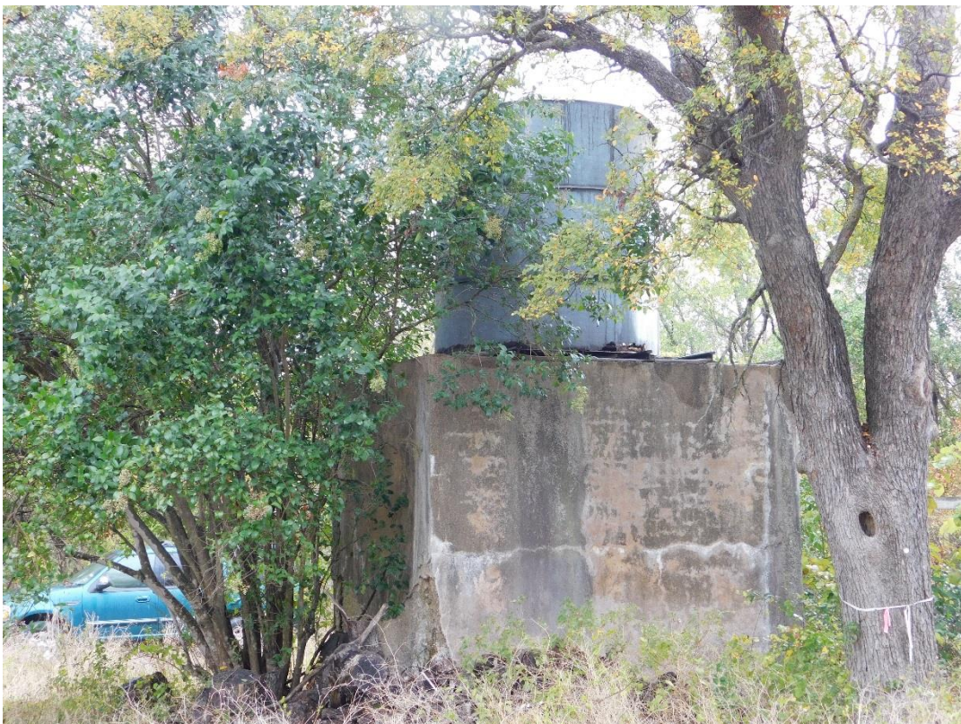
Cistern of undetermined age to the west of the house.