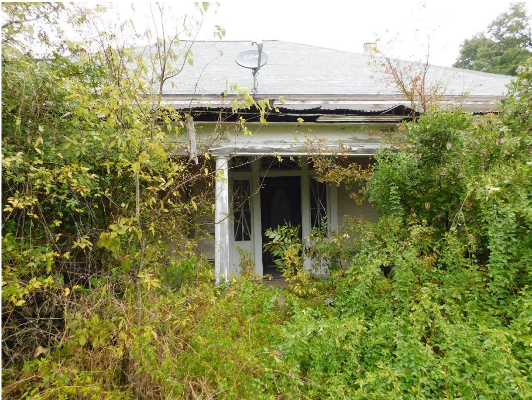
Neo-Classical entry and porch across the east elevation of the house.