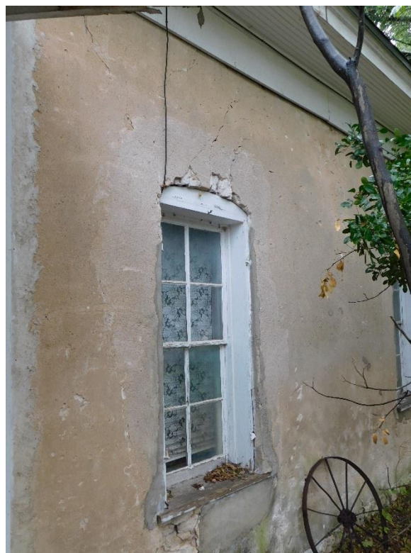
Close-up view of the segmental-arched window opening in the stuccoed stone section of the house.