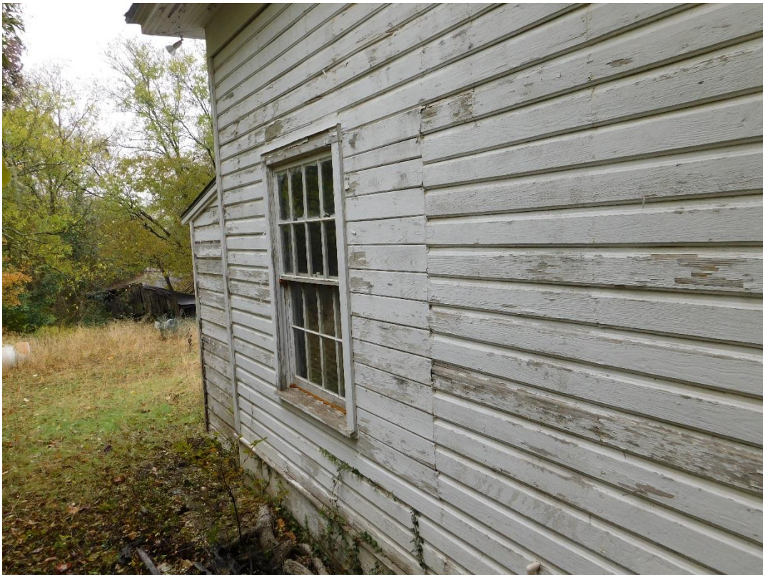
View showing what is believed to be the 1910s addition (right) and a later addition containing the 8:8 window.