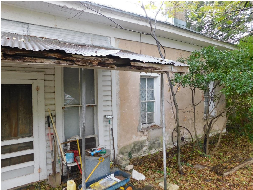
West elevation of the house showing the stuccoed stone section and the frame addition.