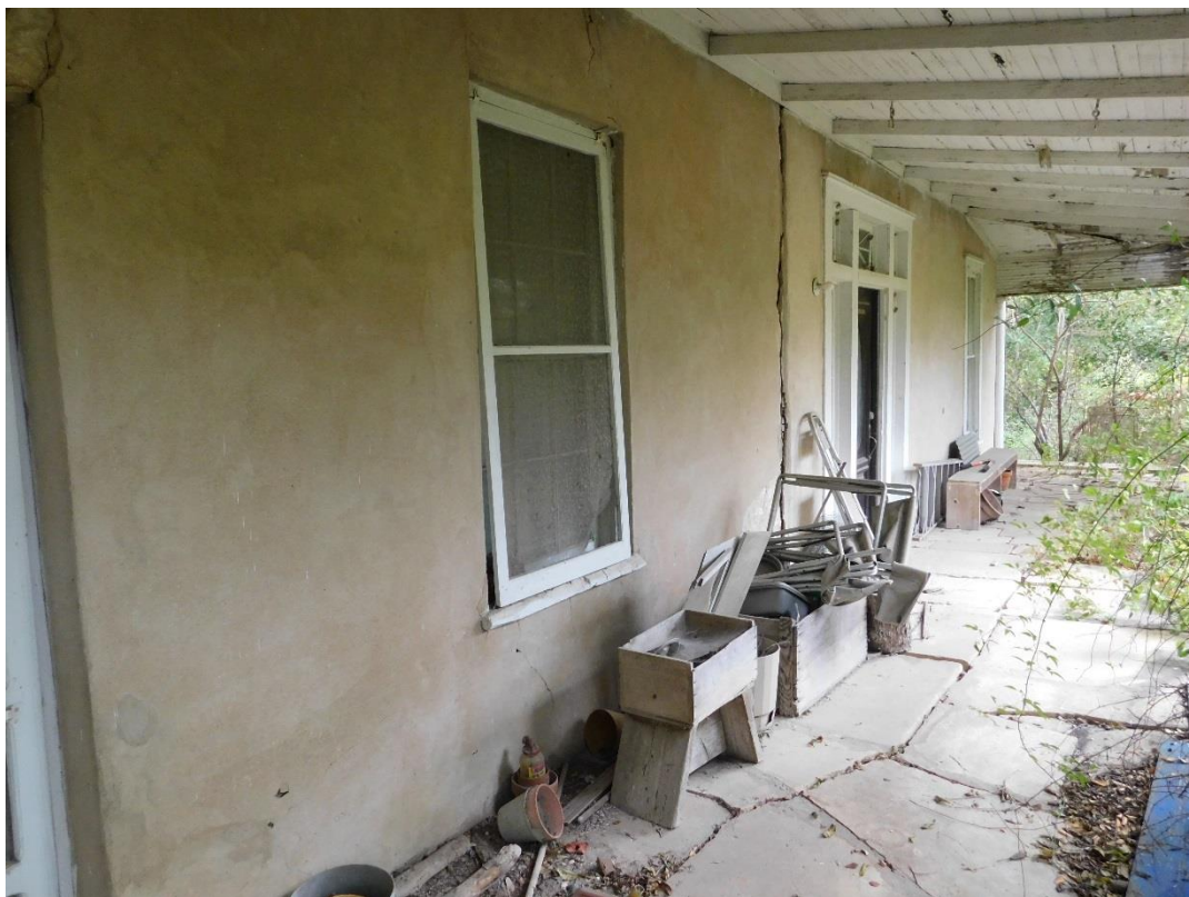
East elevation of the house.