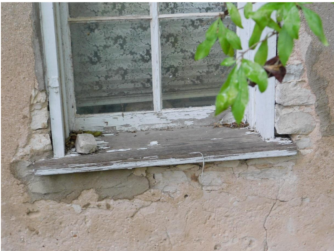
View of a window in the stuccoed stone section showing the building materials.