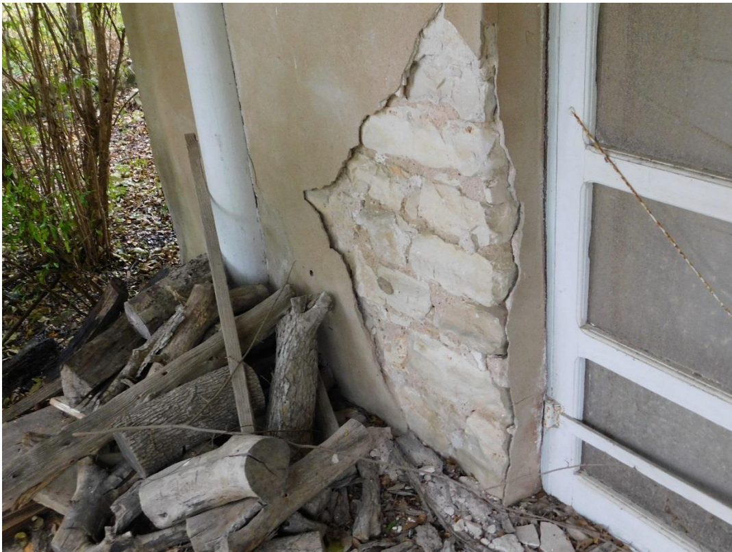
Stuccoed stone section on the east elevation of the house.