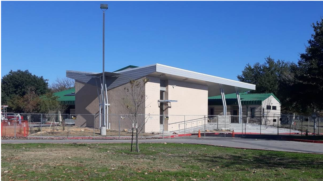
Exterior view of the facility