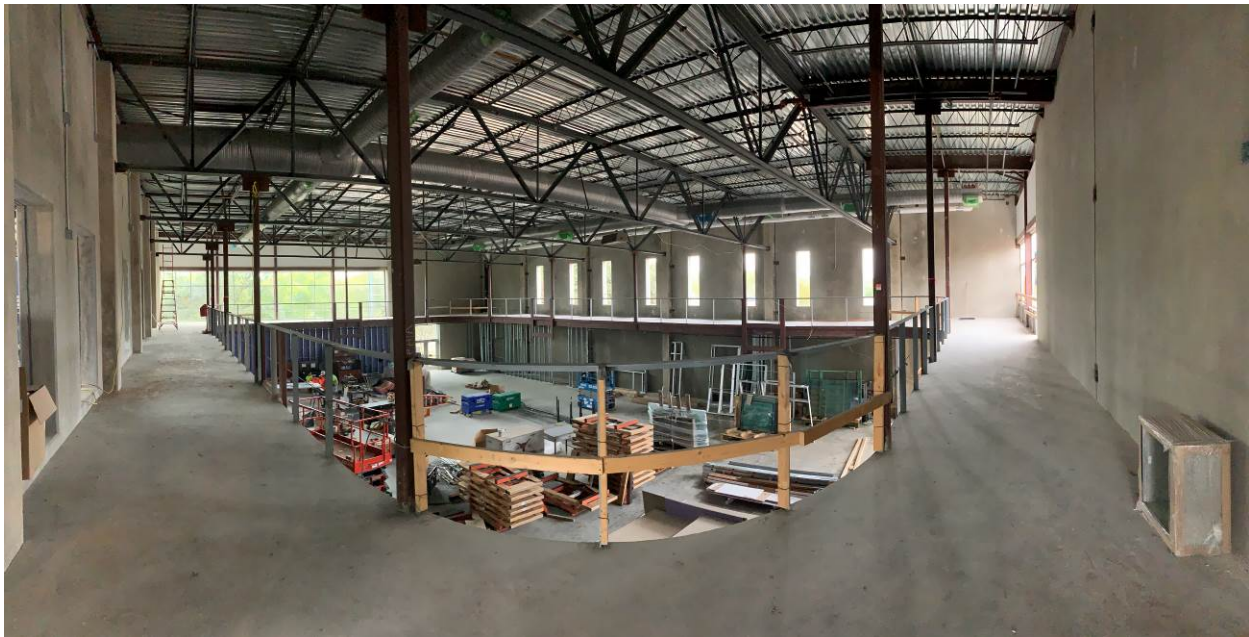
View of the gym interior

The project is pursuing LEED Silver certification, and it is funded by 2012 G.O. Bond funds. District 3