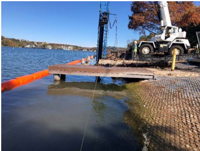
Installation of bulkhead sheet piles