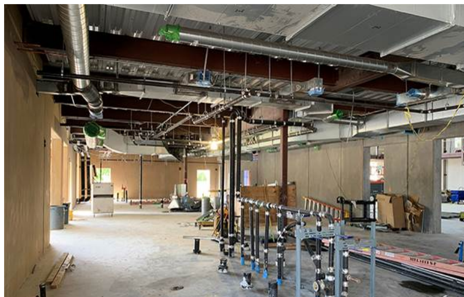
Interior view of south building illustrating mechanical, electrical and plumbing installation.