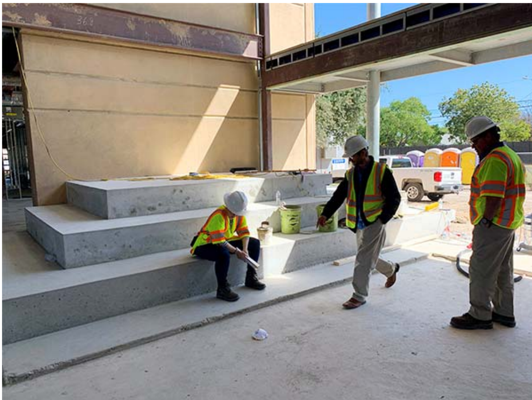
Lobby staircase/sitting steps concrete poured