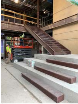
Metal staircase installed in lobby