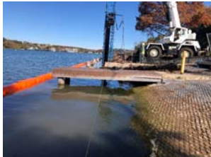
Installation of bulkhead sheet piles