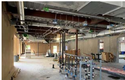
Interior view of south building illustrating mechanical, electrical and plumbing installation.