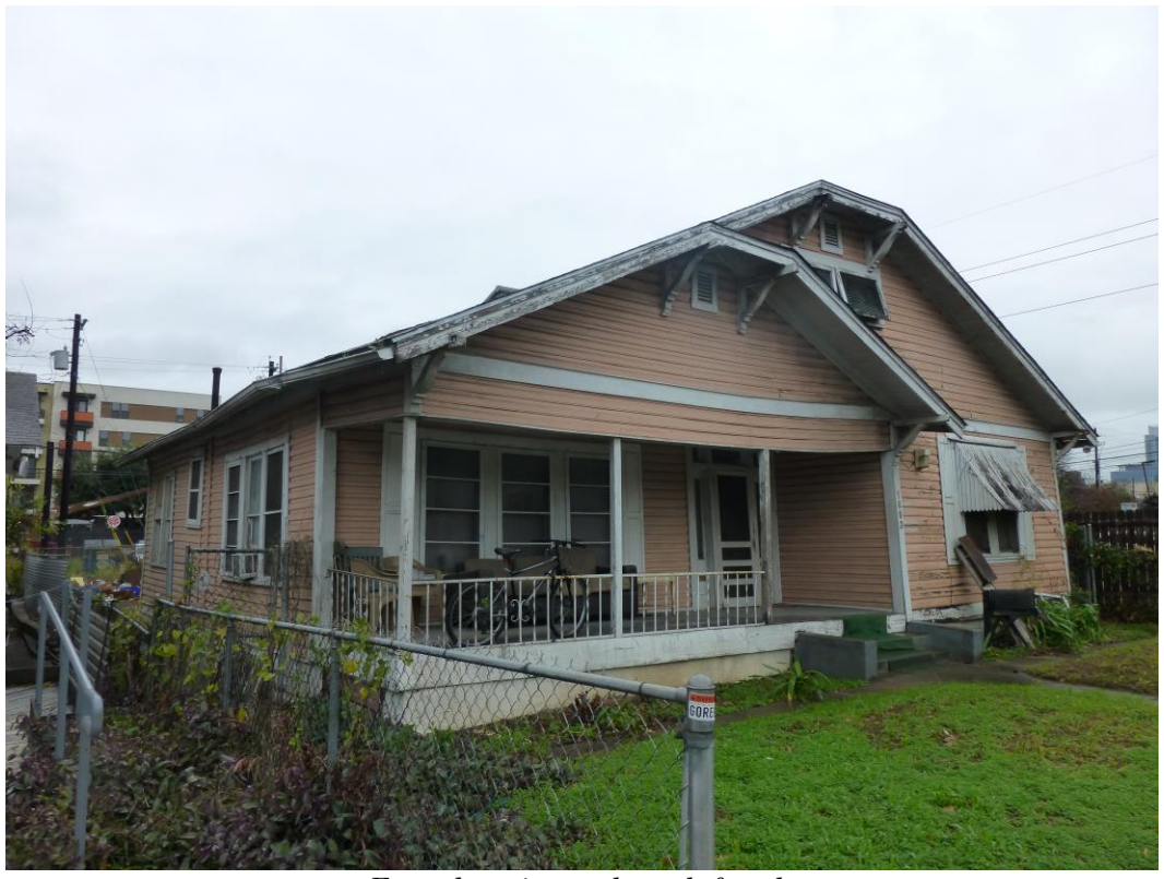
East elevation and north façade.