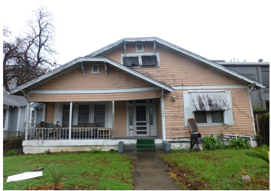
Primary (north) façade of 1603 E. 7th Street.