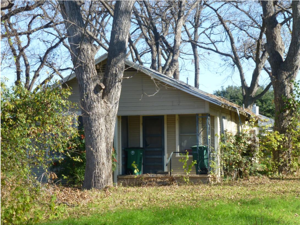
Primary (west) façade of front house at 1135 Walton Lane.