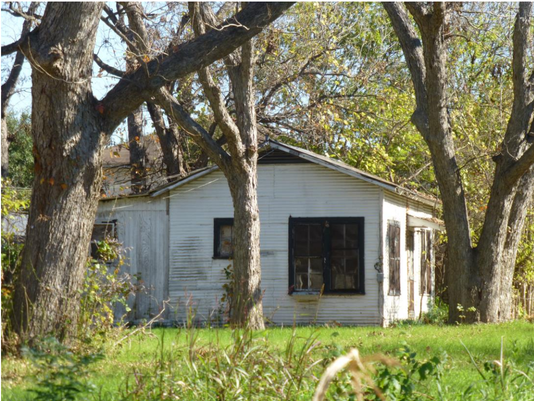
West elevation and south façade of back house.