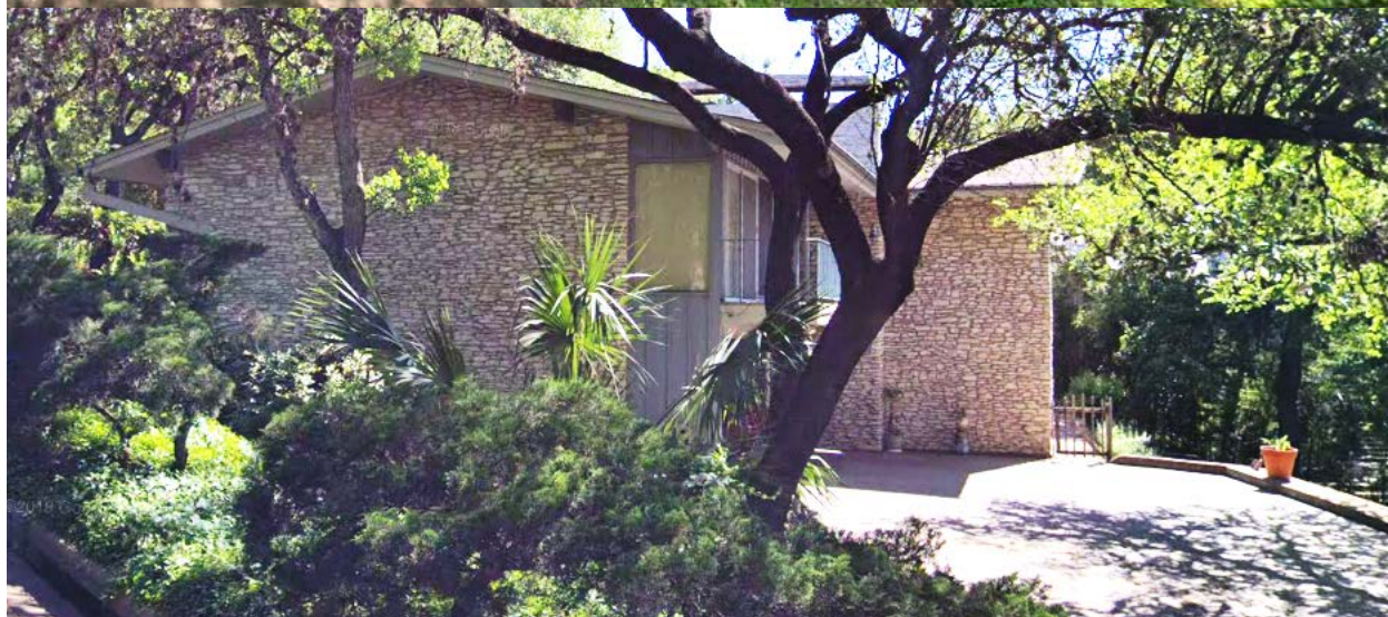
Street View, 2018