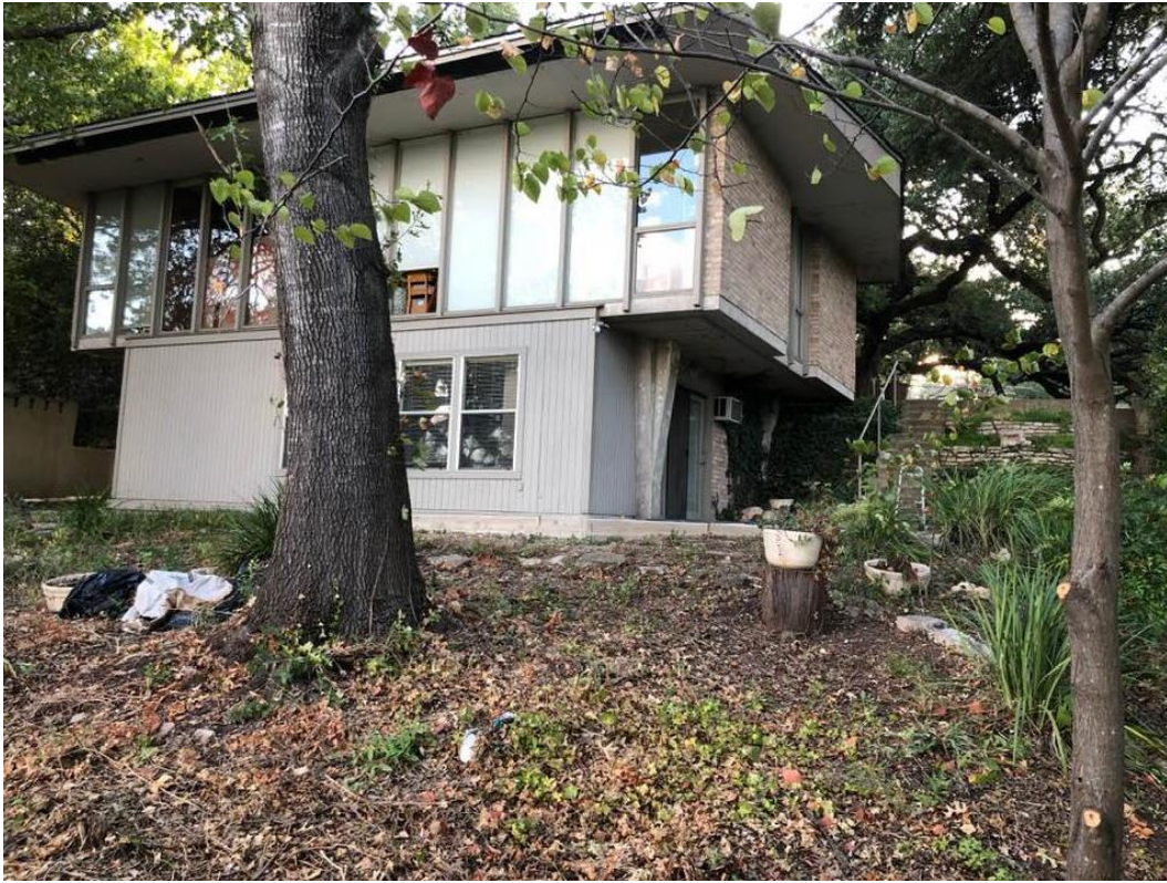
West elevation.