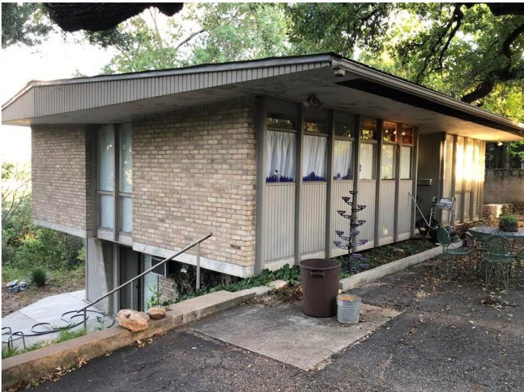
North elevation and west façade.