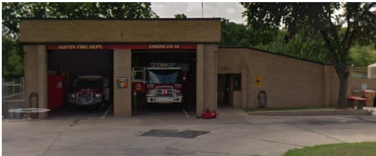
Engine Co. 24 / South Austin Fire Station (5800 Nuckols Crossing Road), designed by Eugene George, Jr.