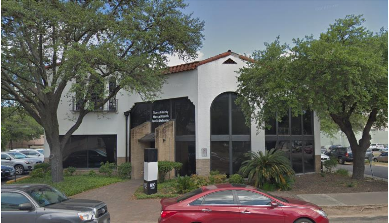
910 Lavaca Street, designed by Eugene George, Jr. in 1978.