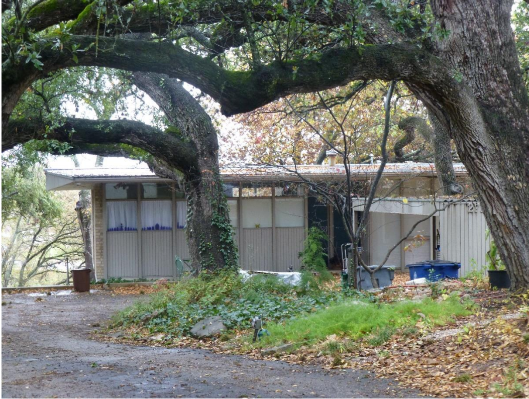
Primary (west) façade of 2719 Wooldridge Drive.