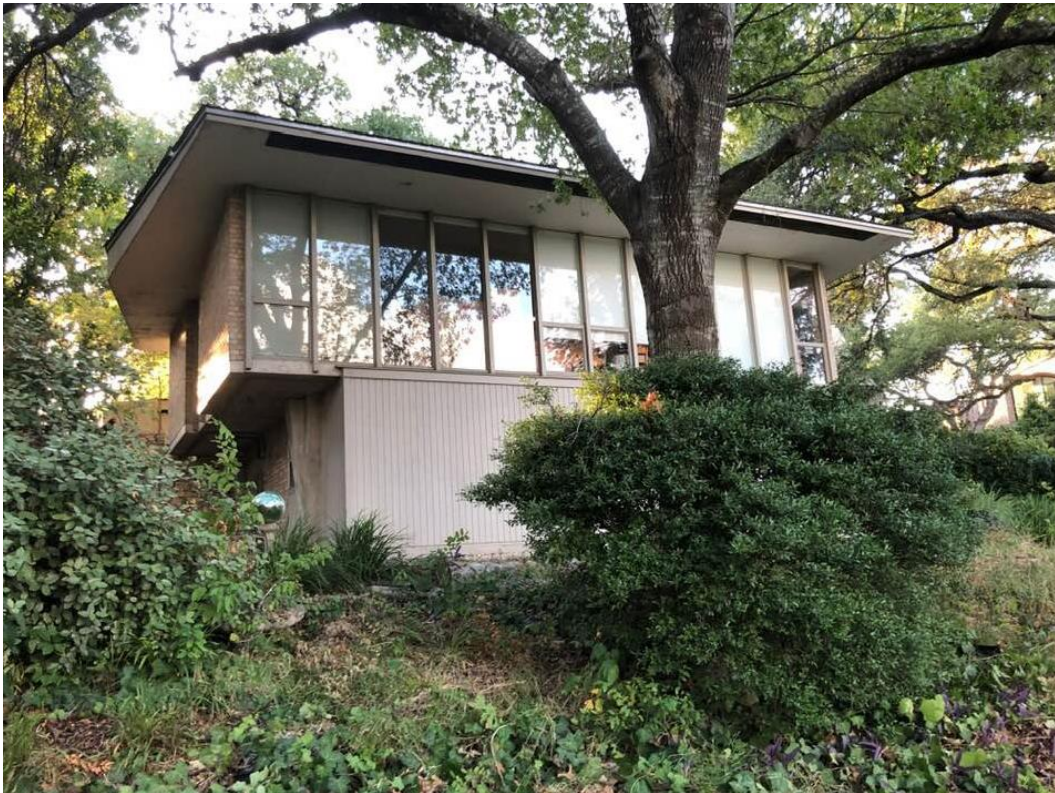
South and west elevations.