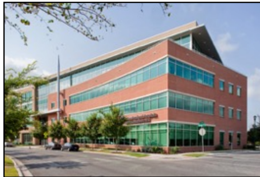
Office 2.6 million sf