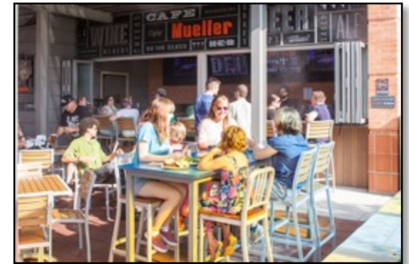
Retail 750,000 sf