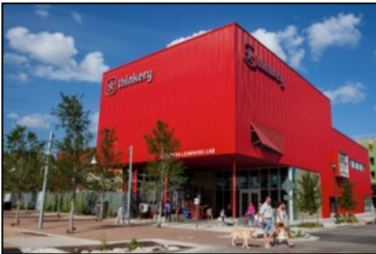
Institutional 1.9 million sf