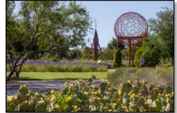
Greenspace 140 acres