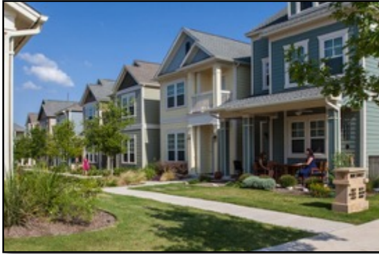
Residential 6,200 single- & multi-family homes