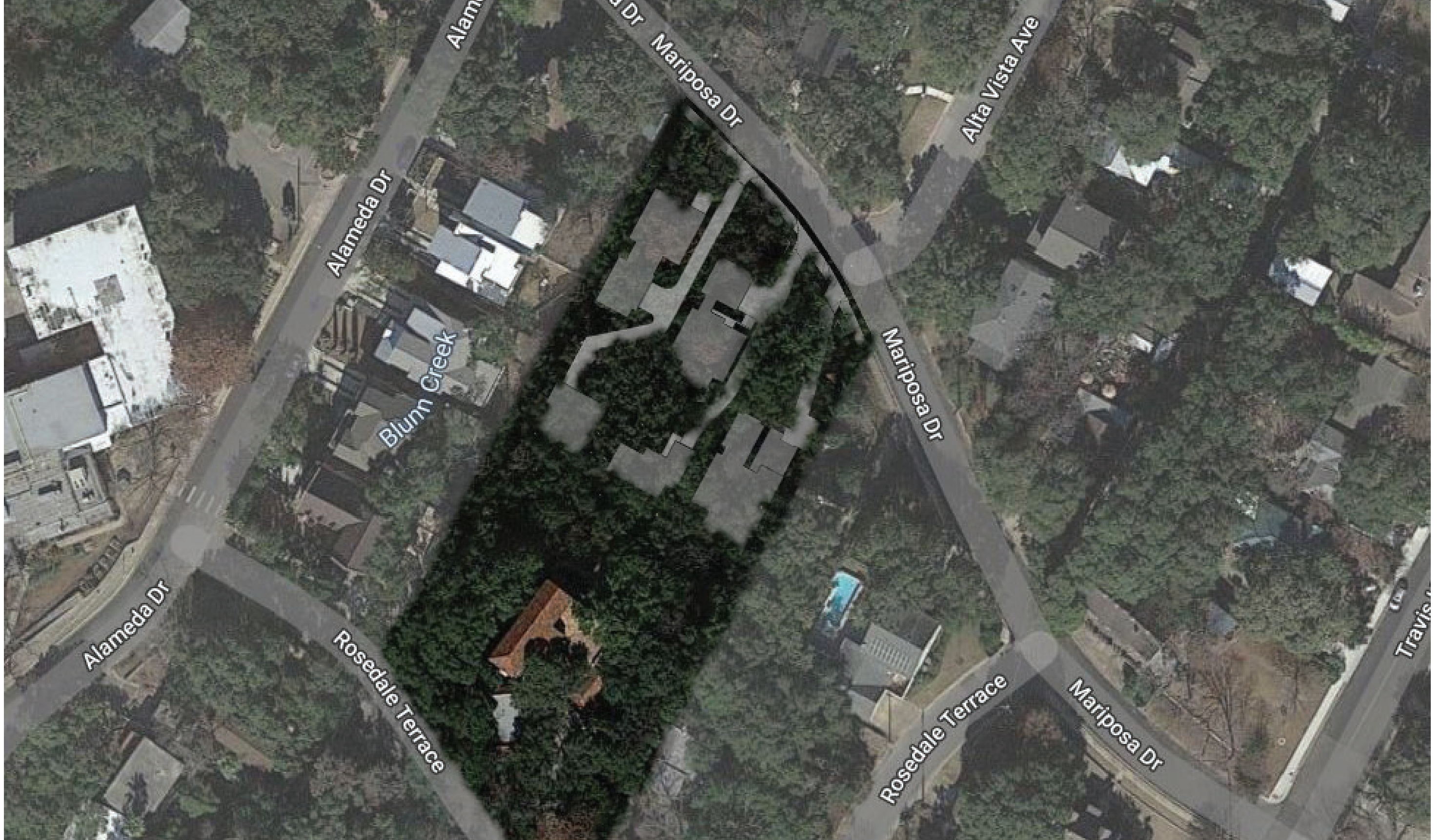
Aerial Site View