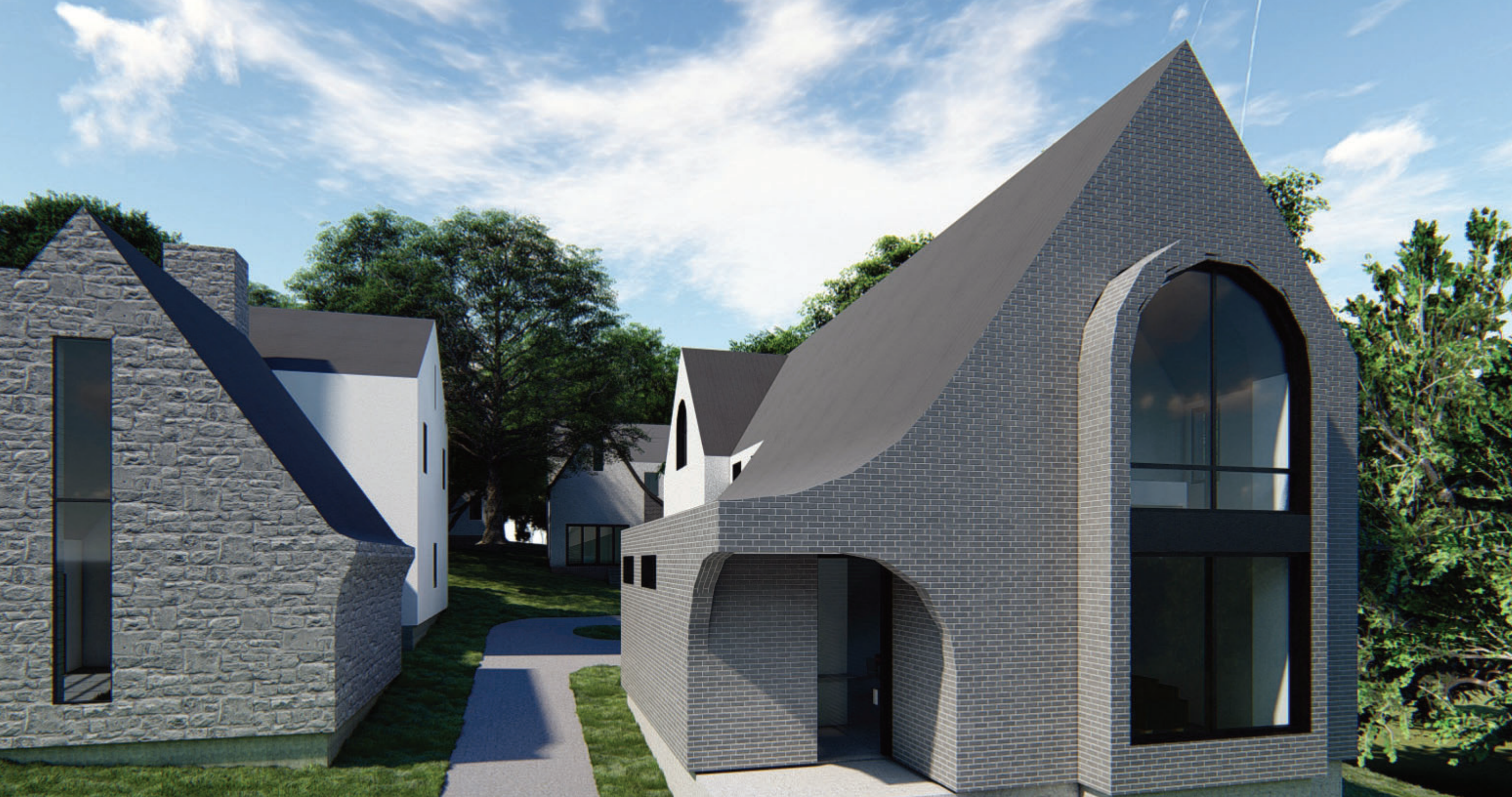
807 Mariposa: House with ADU in the back.