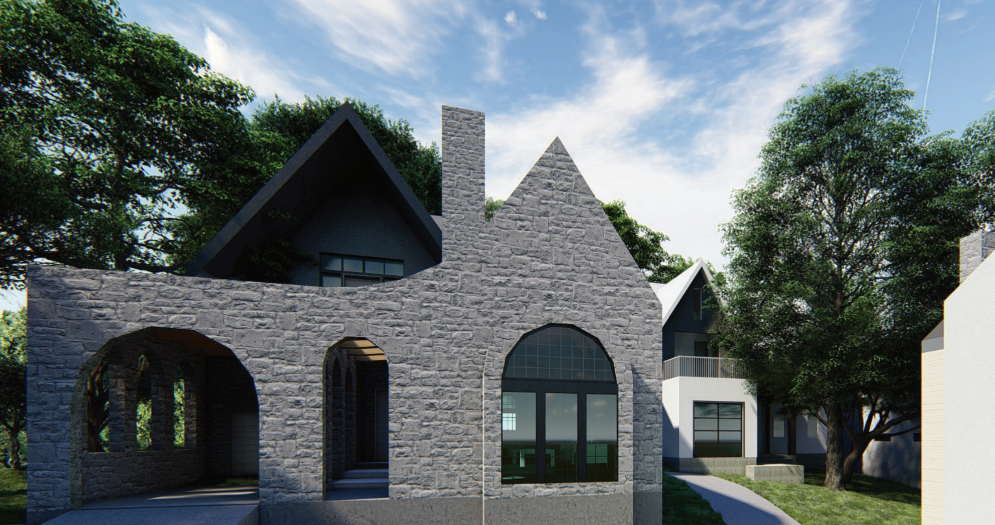
811 Mariposa: House