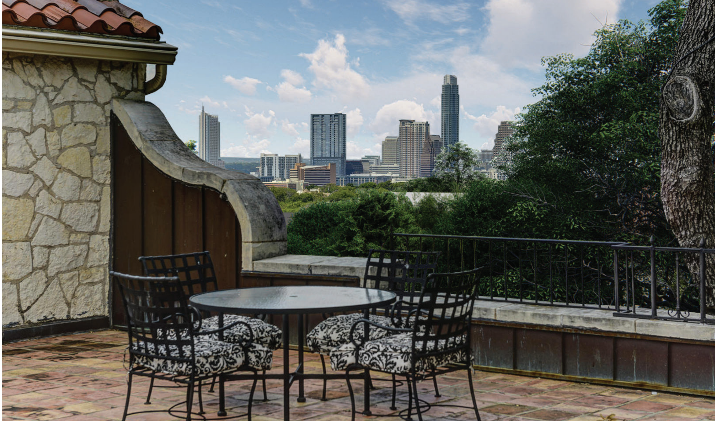
A view from the rooftop deck of the Reuter House showing the view over the tree canopy, with the proposed roof of 809 Mariposa shown in white within the canopy.