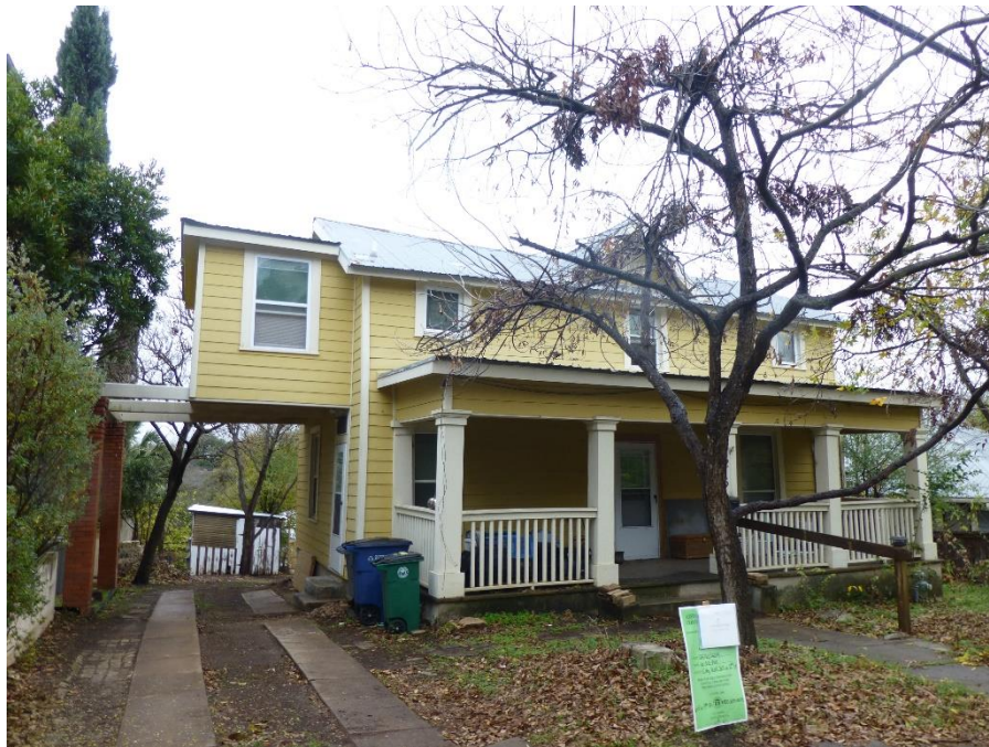
Primary (north) façade and east elevation of 1215 W. 9 th Street.