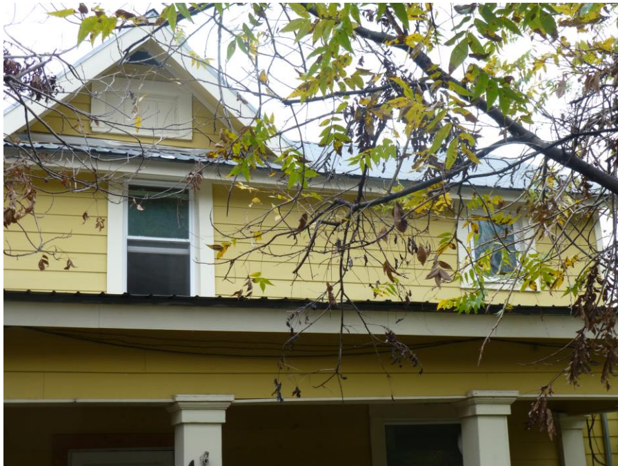
Detail of gable end and second-story windows.