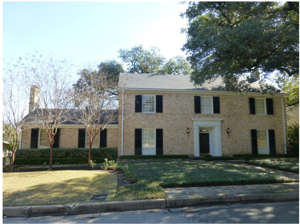
Primary (west) façade of 2411 Pemberton Place.