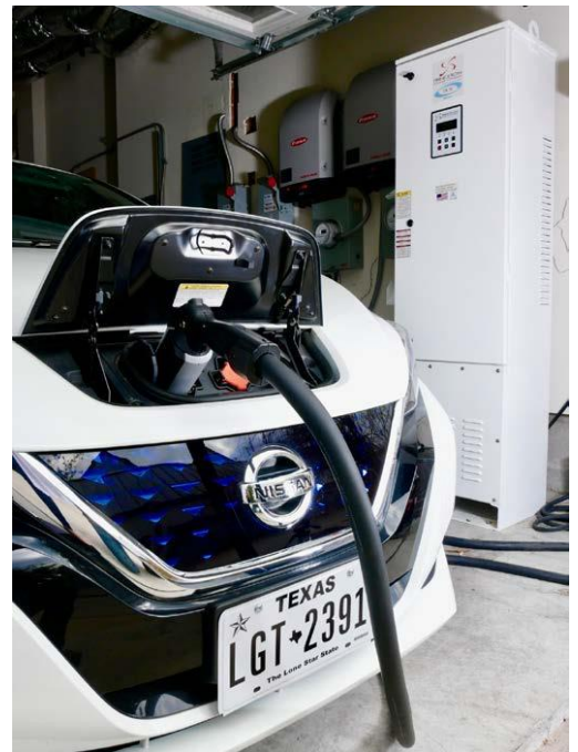
Figure 1: Nissan LEAF 10kW V2G Demonstration at Pecan Street Lab, part of Austin Energy SHINES Project

In February 2019, Austin Energy and Pecan Street Inc. launched Texas' first vehicle-to-grid (V2G) research and testing center to develop and pilot hardware and software innovations to examine the commercialization of V2G applications. The V2G initiative is part of Austin Energy's Sustainable and Holistic Integration of Energy Storage and Solar Photovoltaics (SHINES) project, in collaboration with grant-funding from the U.S. Department of Energy and the State of Texas.