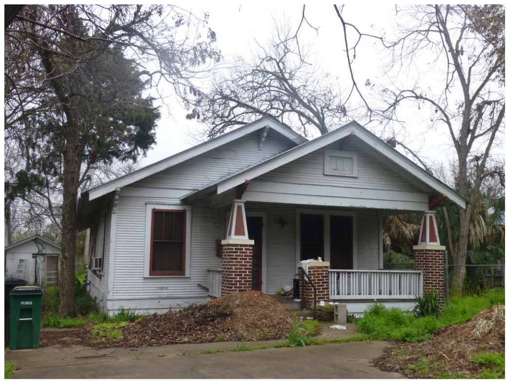
Primary (west) façade.