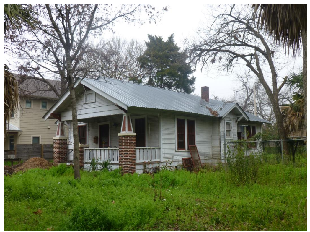
Primary façade and south elevation.