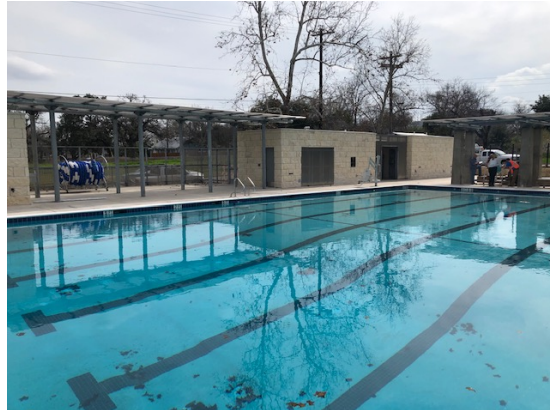
View of pool looking east towards restrooms