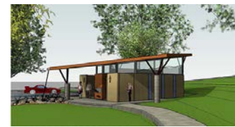
View from Hillside Theater

Construction for the new Trailhead restroom at Zilker Metropolitan Park will start in March 2020. The project will establish a new restroom facility near the Barton Creek Greenbelt trailhead at the southern end of the Barton Springs pool parking lot adjacent to the Zilker Hillside Theater. The restroom facility is intended to serve trail and park visitors, and theater patrons. The project is funded by 2012 G.O. Bonds and Parkland Dedication Fees.