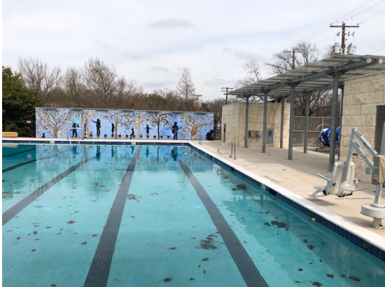
View of pool looking north towards mural