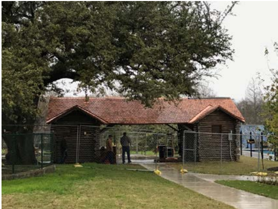
View of the log cabin looking north

A historically significant structure, the rustic log shelter house was built in 1930 to provide restrooms, storage, and a covered dogtrot breezeway for recreation and performances in Shipe Park. It is a contributing resource to the Hyde Park Historic District, listed on the National Register of Historic Places. The restoration project includes replacing the cedar roof and repairing the log walls. Installation of a new cedar shake roof with copper flashing is nearing completion. Deteriorated logs were repaired and new chinking & daubing was installed to fill gaps between the logs. In addition, exterior light fixtures will be replaced. The project is coordinated by PARD and funded by the Friends of Shipe Park, Austin Parks Foundation, and PARD. Anticipated Substantial Completion is in late February 2020.