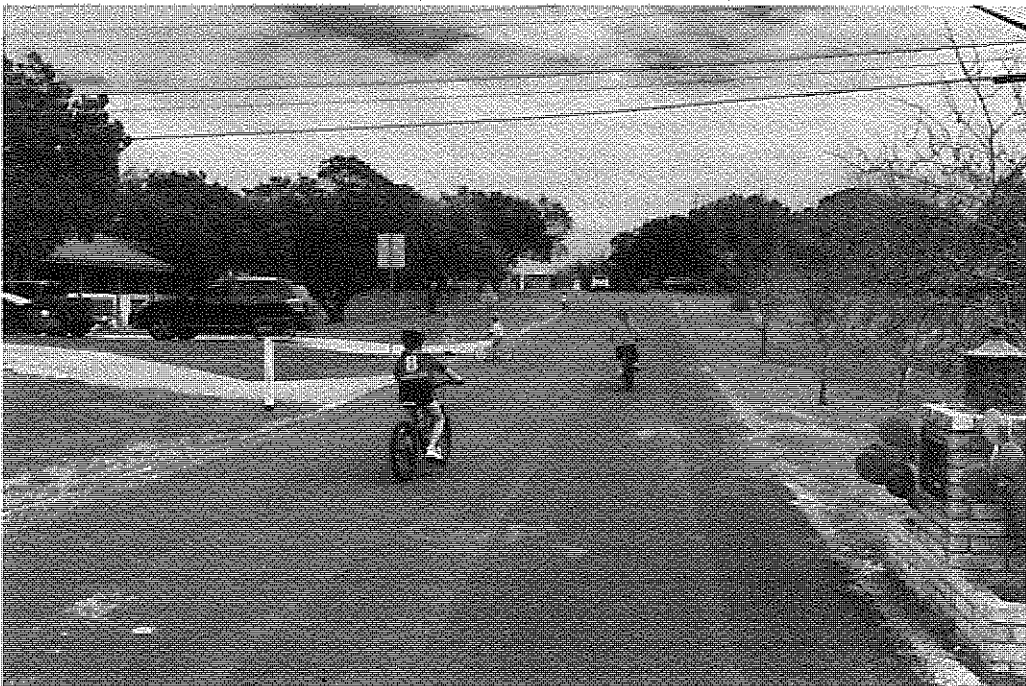
VIEW LOOKING TO THE DEAD END OF LITTLE DEER XING (THE WHITE TRUCK IS PARKED AT THE DEAD END) WHERE IT'S BEING PROPOSED TO CONTINUE TO MEET WITH OAK FOREST LANE

VERY NARROW STREETS, NO CURBS, LOTS OF HILLS AND LOTS OF KIDS PLAYING