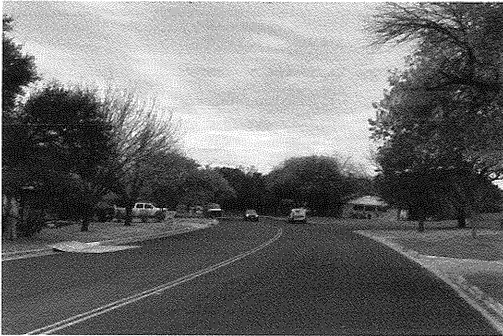
SCENIC BROOK DR.

THIS IS A VERY WIDE TWO-LANE ROAD WITH CURBS AND SIDEWALKS IN SOME AREAS