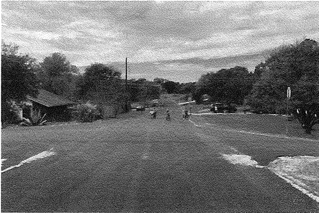
VIEW FROM THE DEAD END OF LITTLE DEER XING

VERY NARROW STREETS, NO CURBS, LOTS OF HILLS AND LOTS OF KIDS PLAYING