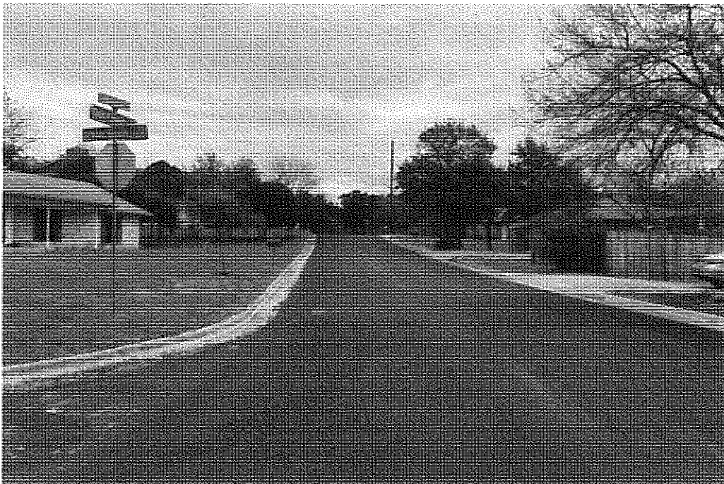
OAK FOREST LANE

THIS IS A VERY WIDE TWO-LANE ROAD WITH CURBS AND SIDEWALKS IN SOME AREAS