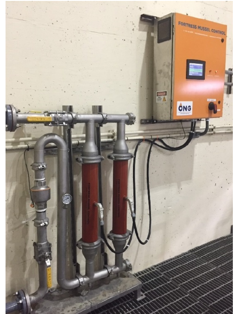
20 MGD Copper Ion Generator Lawrence, KS