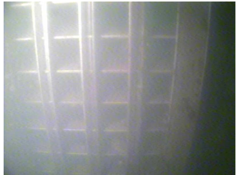
Handcox WTP Upper Intake Before and After Cleaning 12.09.2019