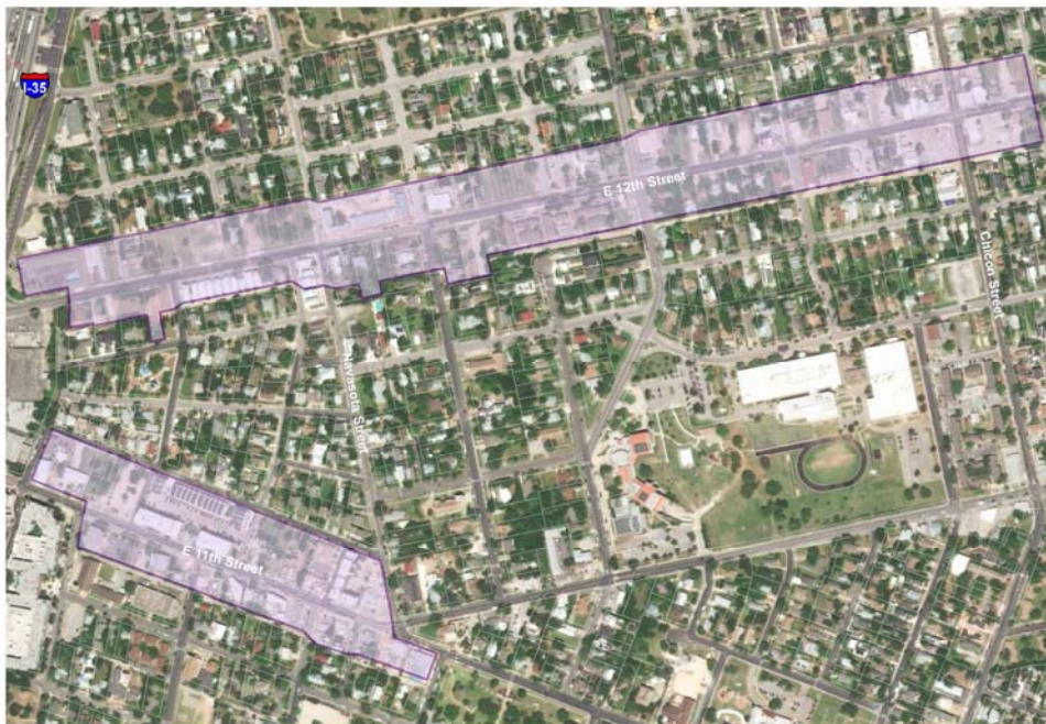
EAST 11TH AND 12TH STREETS URBAN RENEWAL PLAN

EAST 11TH AND 12TH STREETS URBAN RENEWAL PLAN AREA