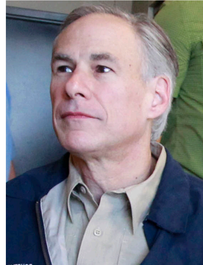
Governor Greg Abbott in 2017

*Source: "Abbott wants 'broad-based law' that pre-empts local regulations" Texas Tribune, March 21, 2017