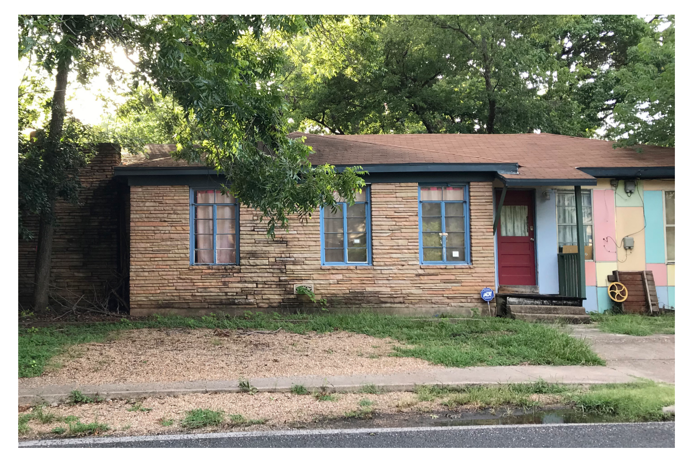
View from Jeffereson Street. All structures to be demolished. Stone to be salvaged for reuse in landscape elements