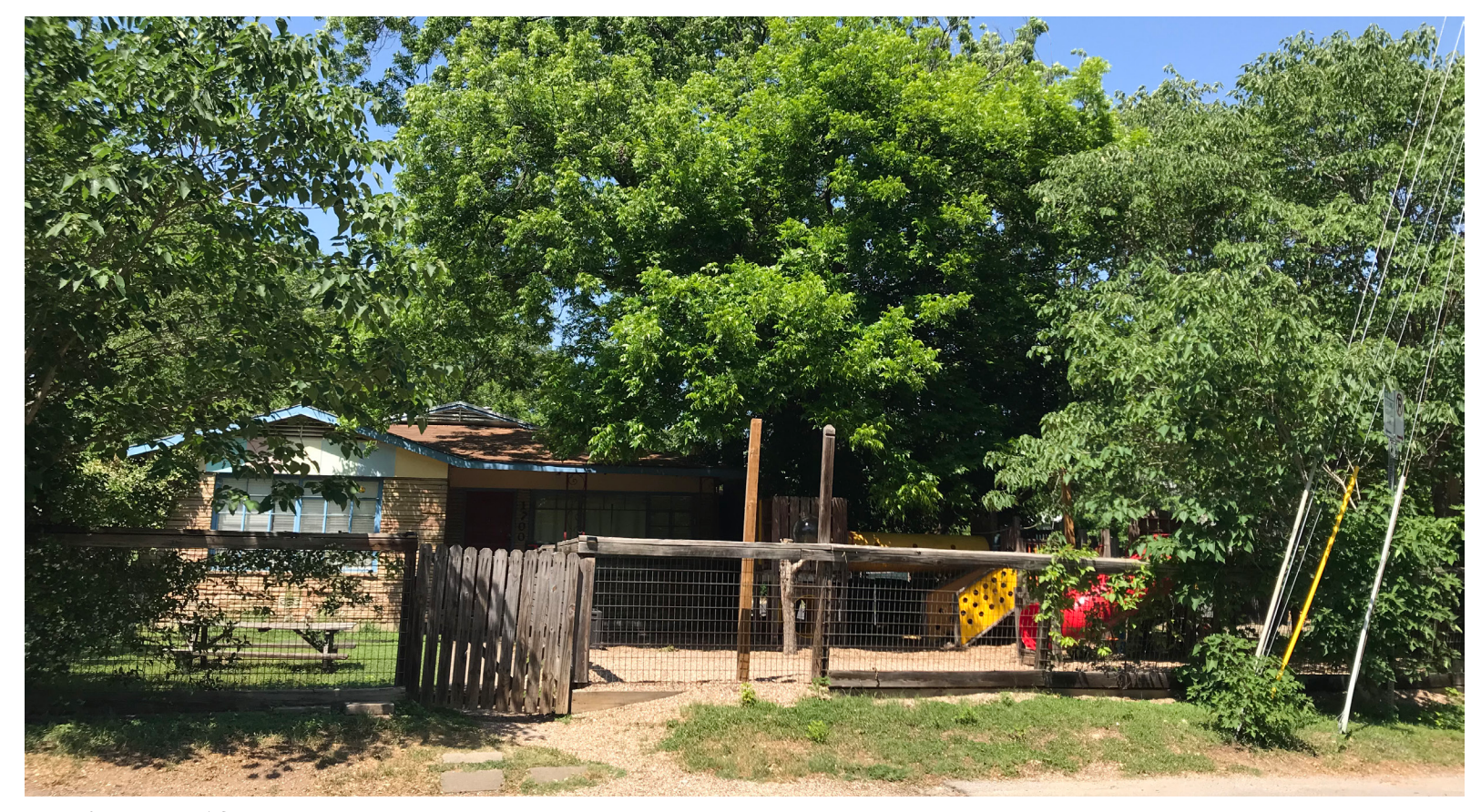
View from W 32nd St.