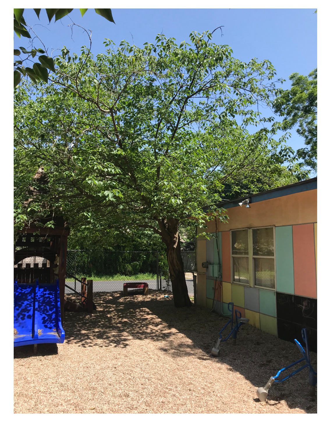
View from inside the property. All structures to be demolished.