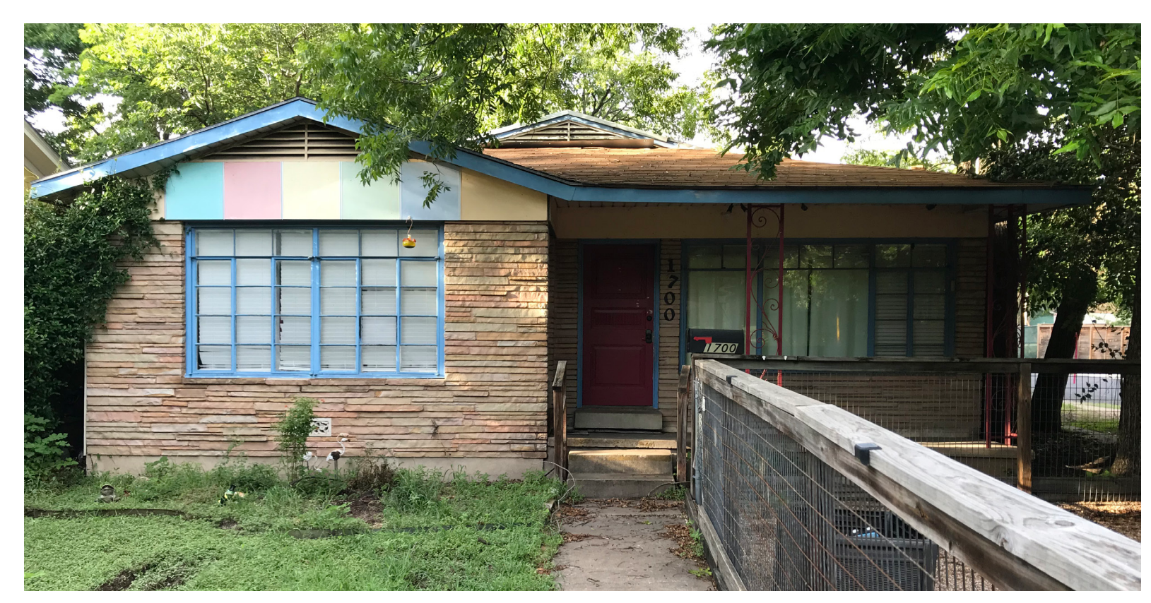
View from W 32nd St. All structures to be demolished. Stone to be salvaged for reuse in landscape elements