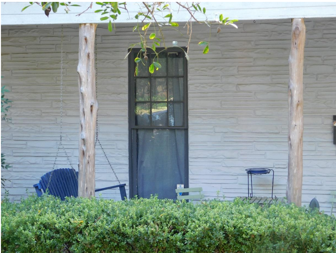
Detail of permastone siding, wood porch posts, and 9:1 window