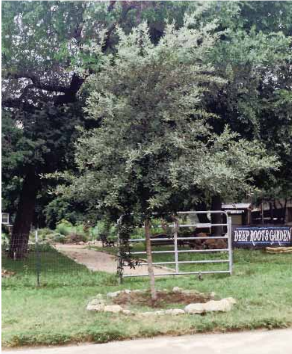
Deep Roots Garden is just off of the main Trail, south of Duncan Park and on the west side of Shoal Creek.

Planning efforts today include the Duncan Park Improvement Project, as well as the 5th to 15th Street Preliminary Engineering Report (PER) , which proposes $25 million of improvements in this area, including a widened main Trail, ADA improvements and a new low-water crossing at West 9th Street. Building off the Urban Trails Master Plan , the primary goal of the PER is to assess the feasibility of widening one mile of the Trail to 12 feet of paved path, along with associated streambank improvements, as well as ADA accessibility improvements, such as the trailheads at 9th Street and north of 6th Street (see photo below). Overall, the PER recommends that the Trail alignment remain the same, with added improvements and access points.