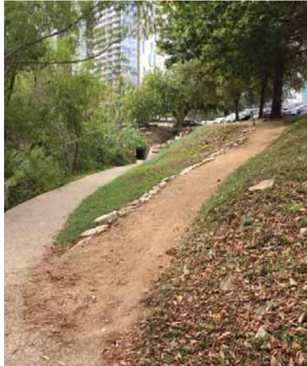
The existing trail up to West 6th Street does not meet ADA or Urban Trail standards, and poses maintenance issues.