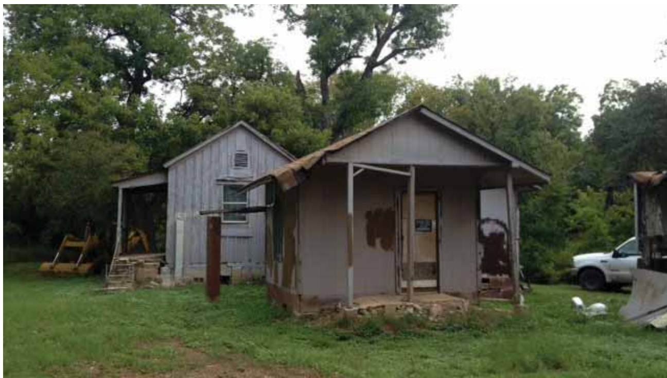
The Wood Street Settlement was located north of West 6th Street. Its remains (shown above) have since been removed. While these homes are now gone, a recently-dedicated Texas Historical Commission marker tells the story of this area.