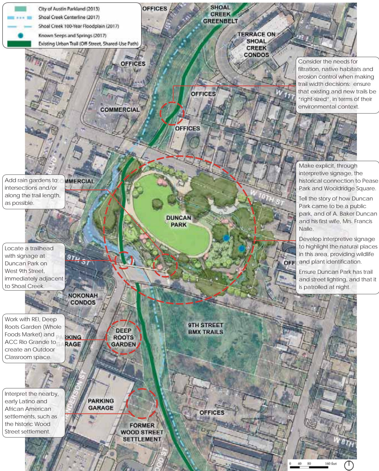
The Duncan Park Focus Area calls for implementation the Parks and Recreation Department's Duncan Park Improvement Project, as well as some of critical improvements from the 5th to 15th Preliminary Engineering Report.