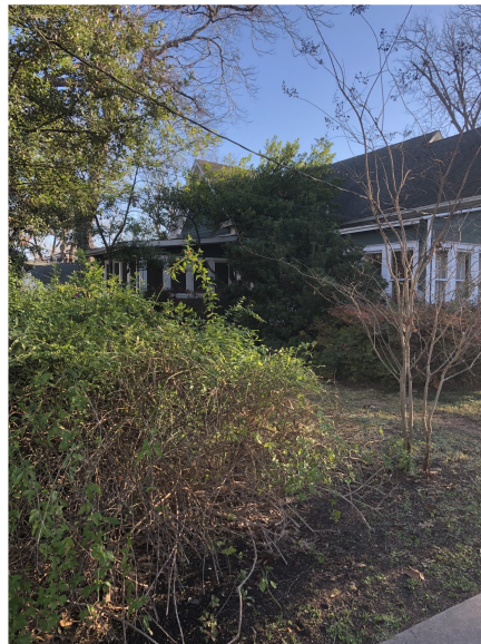
West door from sidewalk