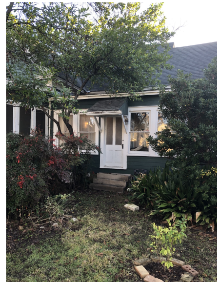
West door from yard